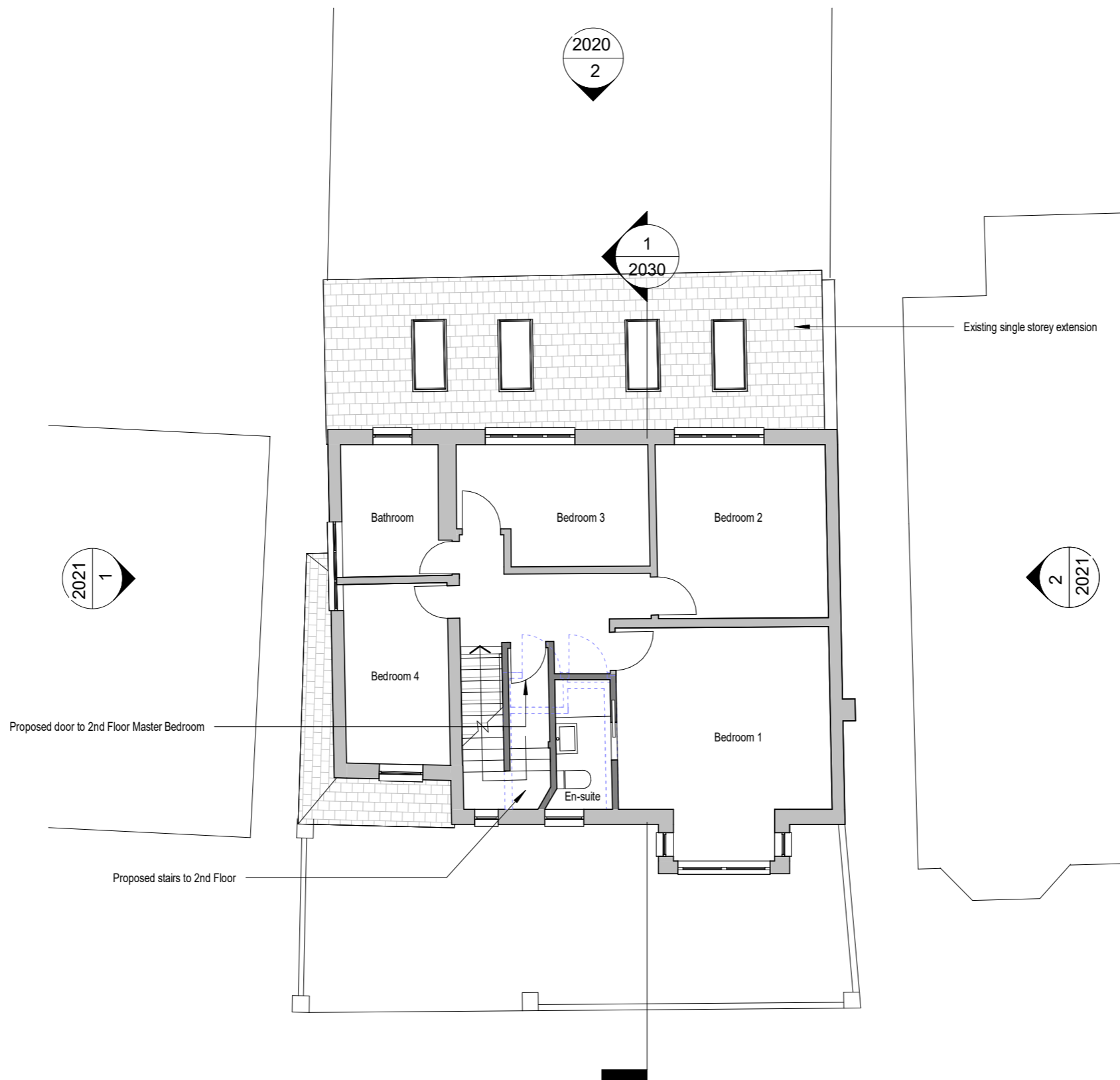
1 Proposed First Floor Plan 1 : 100