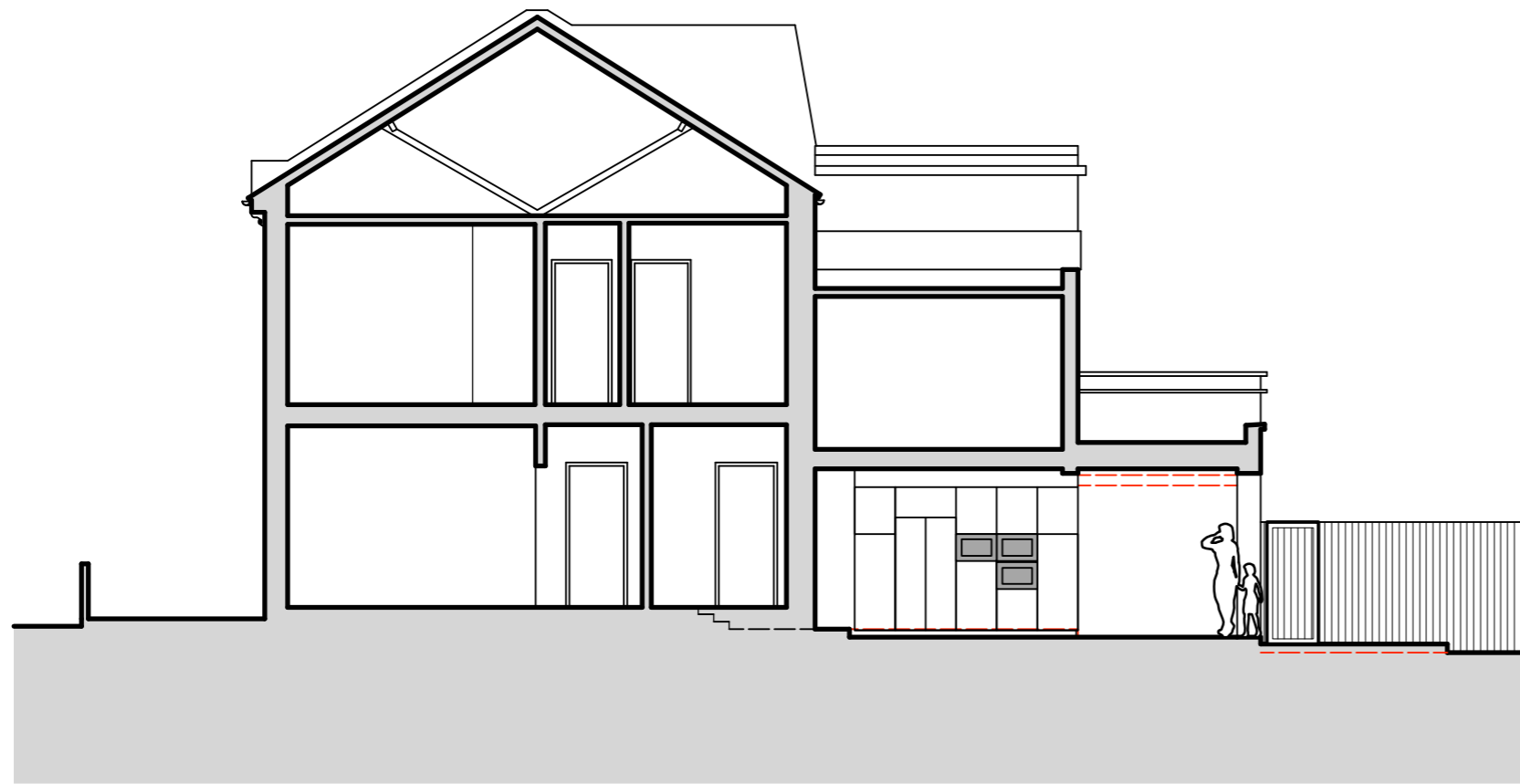
01 Proposed Section A-A