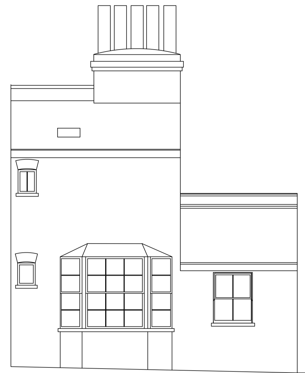
SIDE ELEVATION AS EXISTING