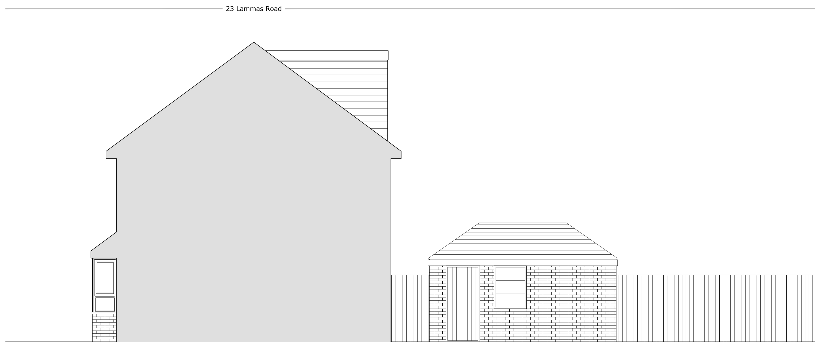
side elevation (west facing) as existing 1:50