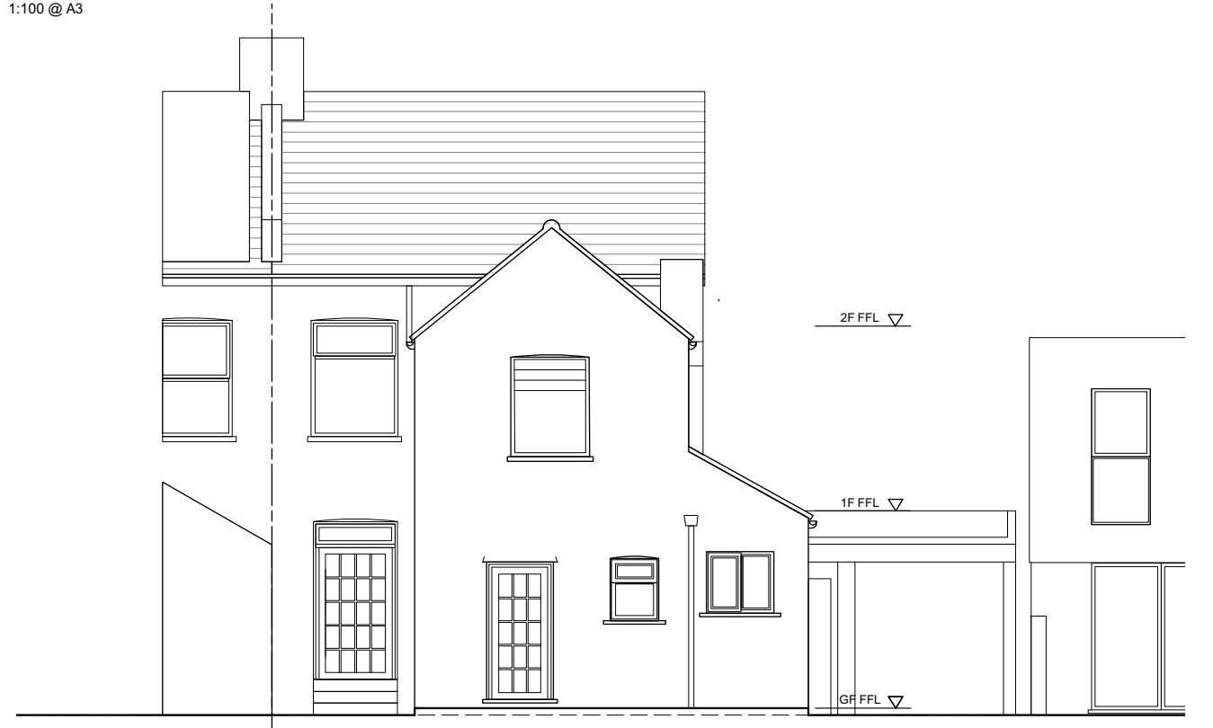
02 Existing Rear Elevation 1:100 @ A3