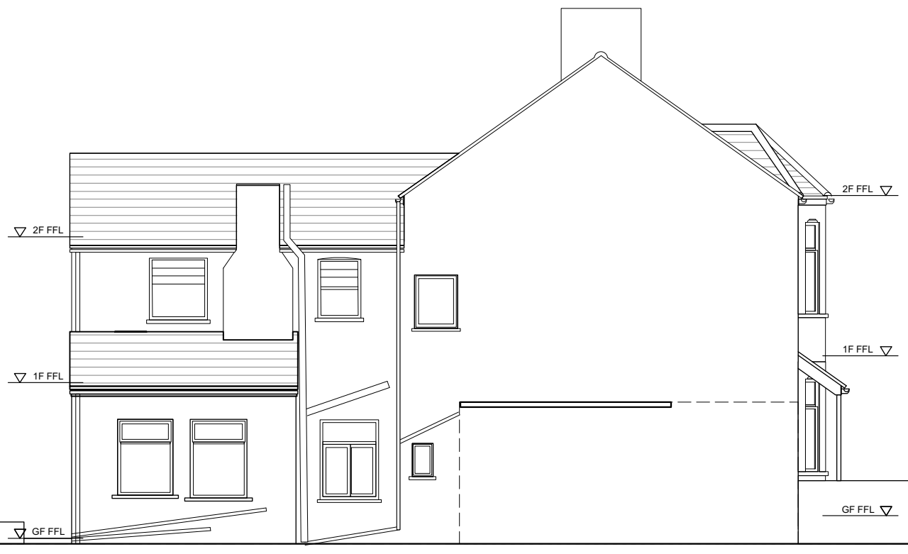
02 Existing Side Elevation 1:100 @ A3