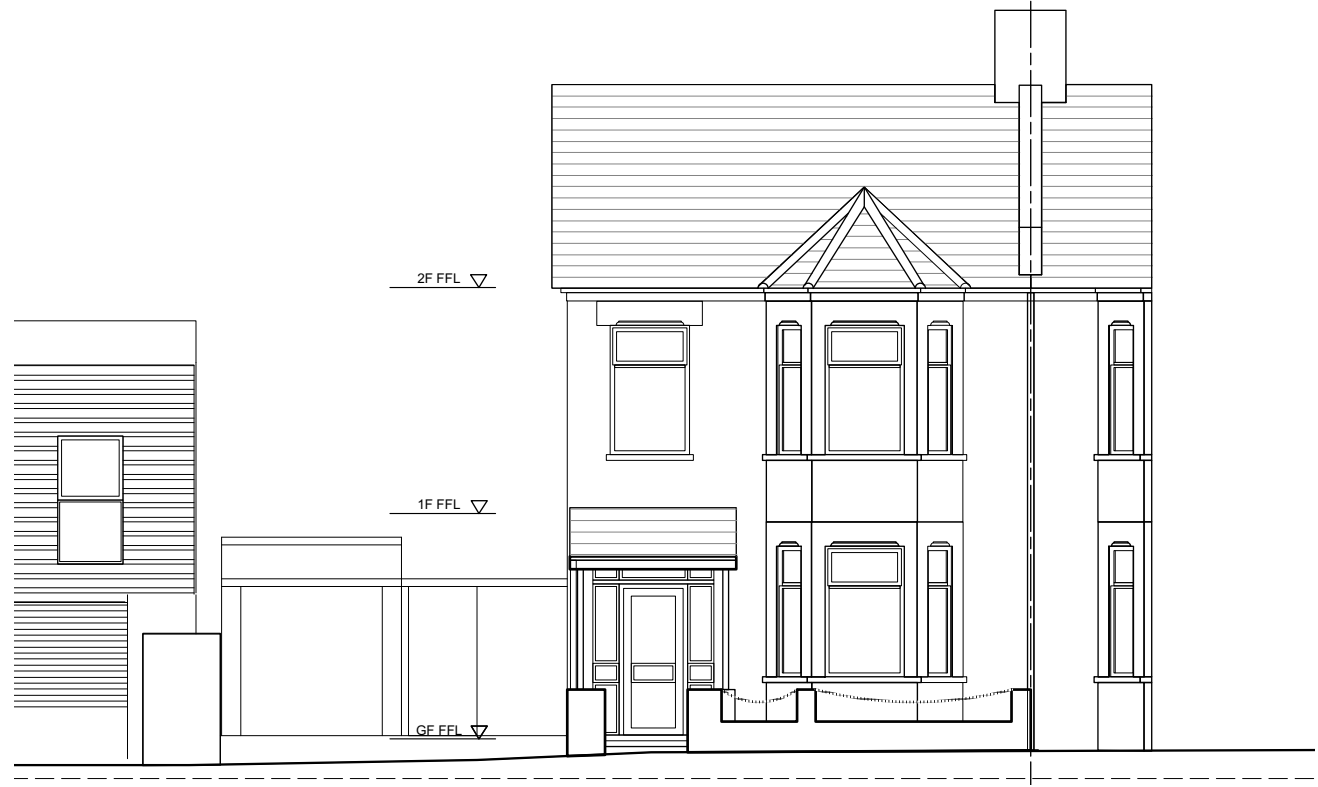
01 Existing Front Elevation 1:100 @ A3