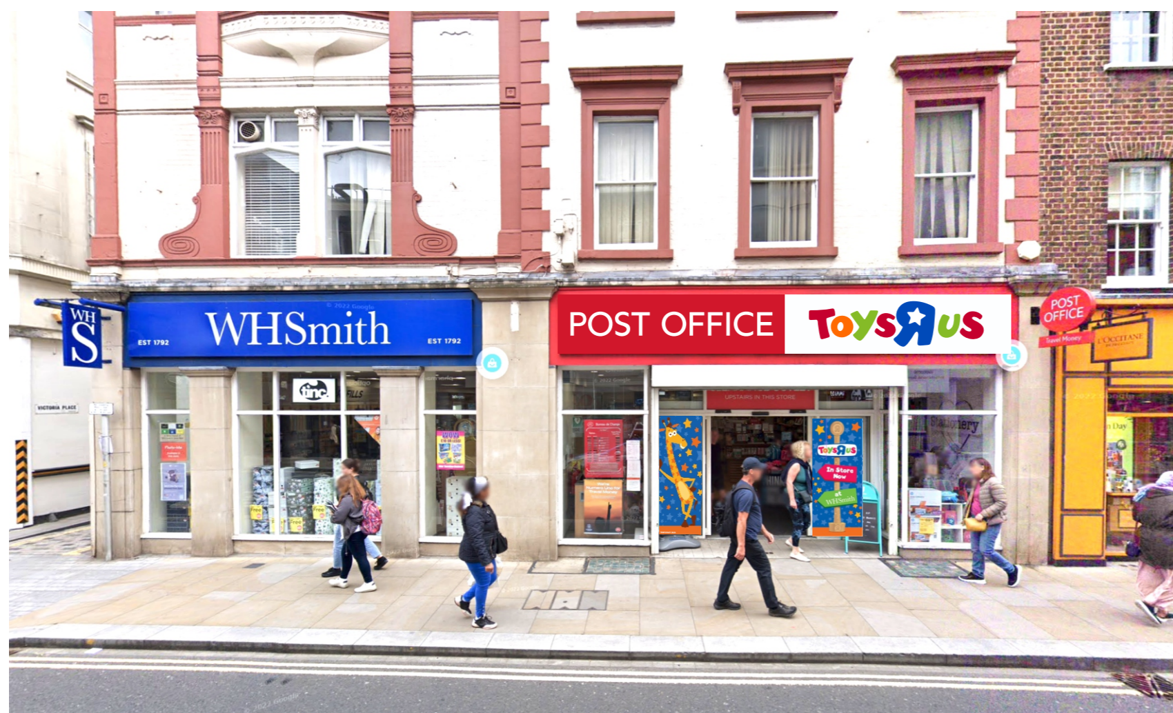
PROPOSED VISUAL SCALE 1:75 @ A3