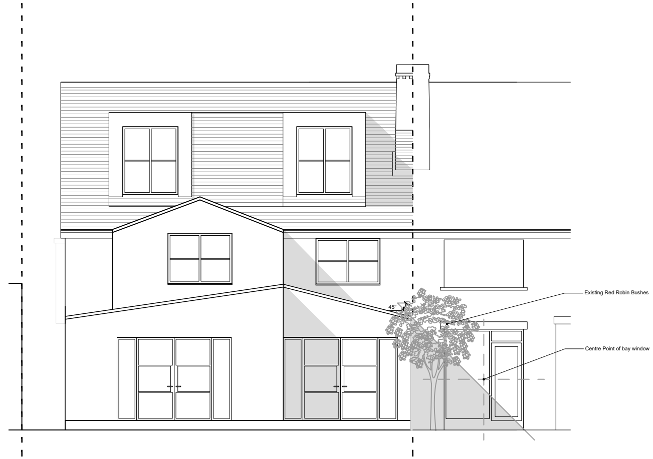
PROPOSED REAR ELEVATION - 45 Degree Rule Study