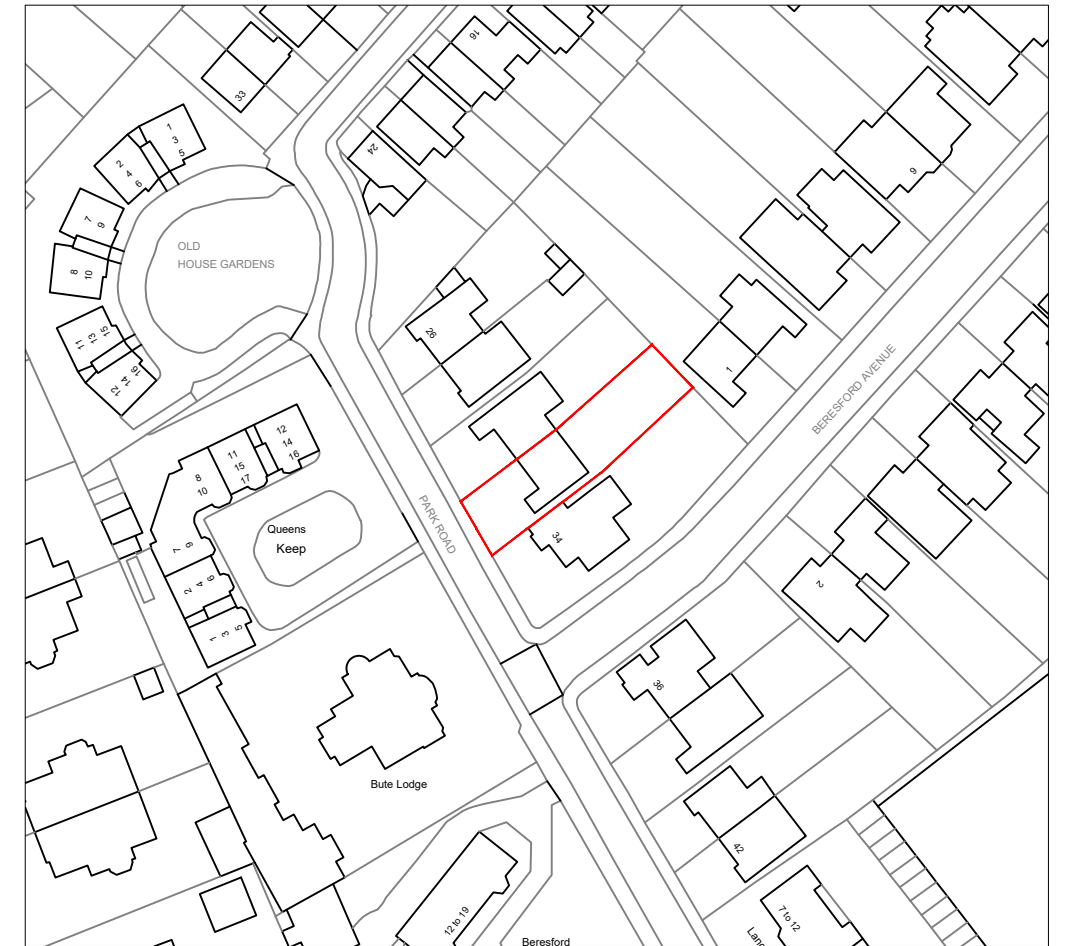
SITE LOCATION PLAN - SCALE 1/1250

This drawing is for planning purposes only. All dimensions used must therefore be verified on site and contractors / sub-contractors who follow them do so at their own risk. This drawing is copyright of Architect and contents must not be disclosed to other parties without prior agreement.