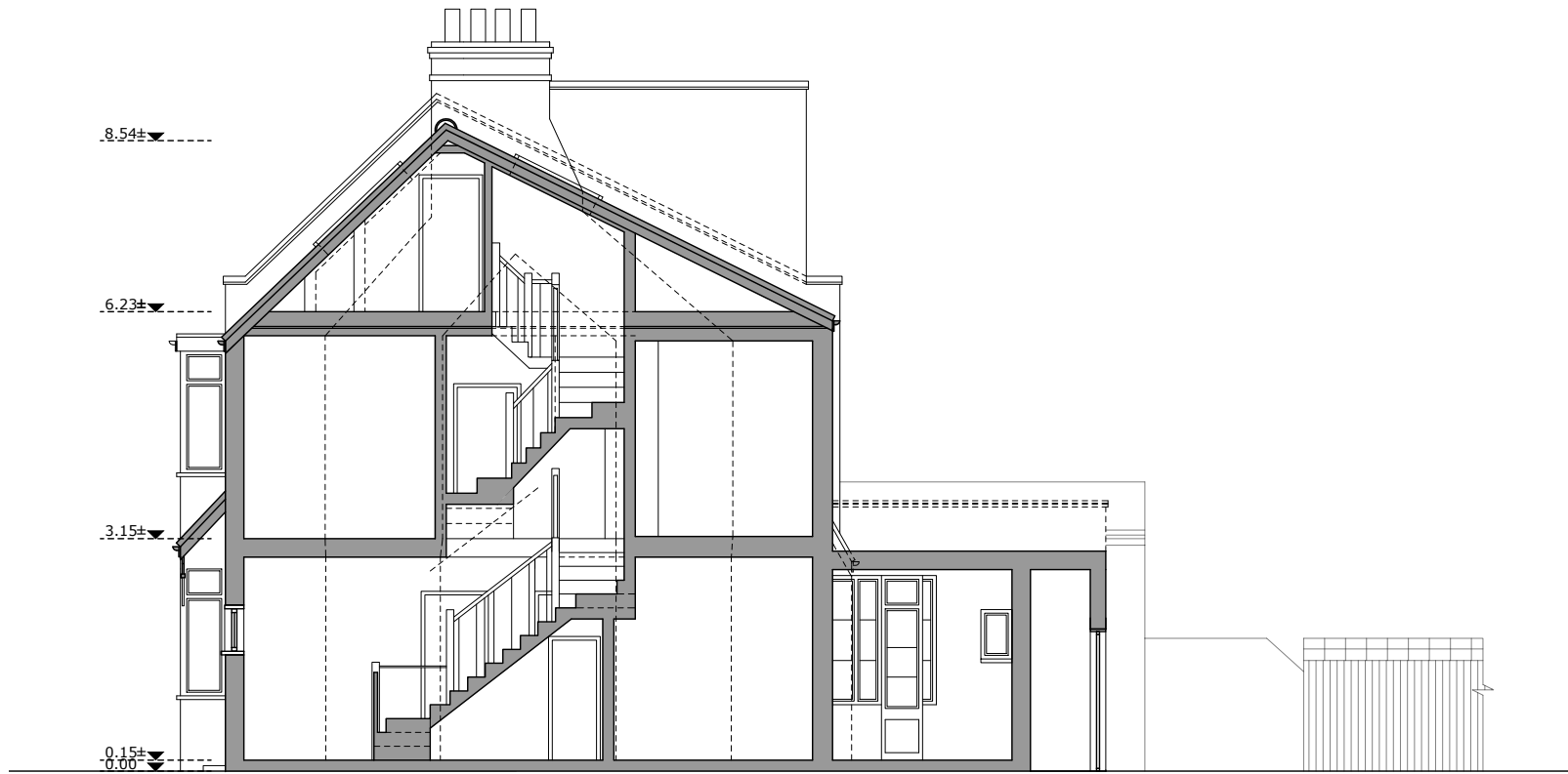
EXISTING SECTION A-A