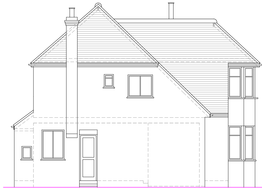
EXISTING SIDE ELEVATION O1