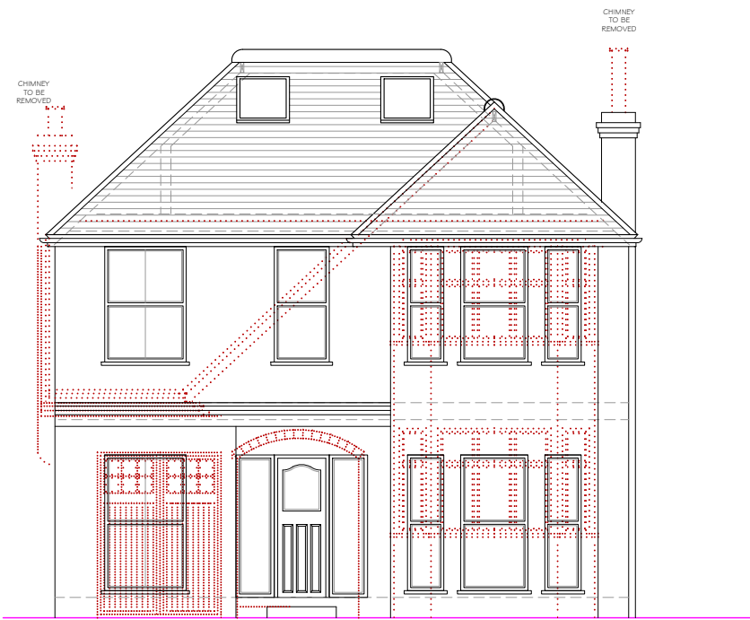
PROPOSED FRONT ELEVATION Proposed Material: Walls: K-Render Finish (White)

Notes All works to be carried out in accordance with current building Regulations. All dimensions / levels to be checked and verified on site before Commencing any work and any discrepancies to be reported to the office immediately. This drawing to be read in conjunction with contract documents, project working drawings, specification, all consultants / specialist drawings, details and specification. All materials to be used in the construction of the external surfaces of the new works shall match those in the existing building. Do not scale from this drawing except for planning drawings. Only figured dimensions to be taken. This drawing is copyright © 2023. Modifications to this drawing may only be carried out by GDB. Must not be reproduced in part or in whole in any form without the prior permission of GDB. This proposal must not be used for any other purpose other than stated above.