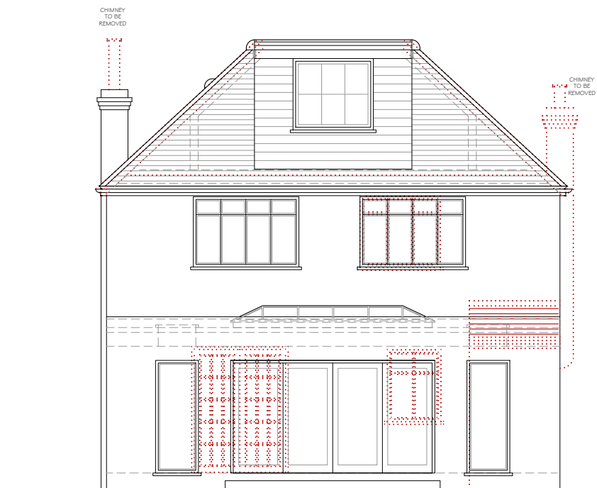
PROPOSED REAR ELEVATION Proposed Material: Walls: K-Render Finish (White)