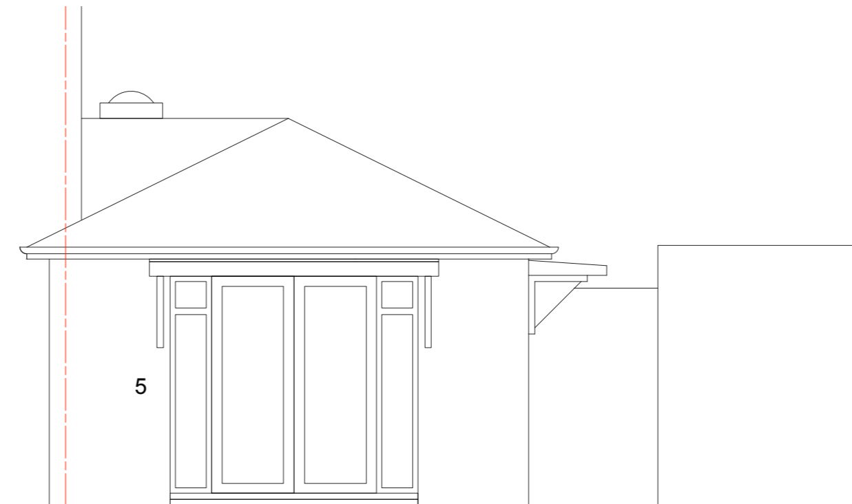
02 Front Elevation 1:50 at A3