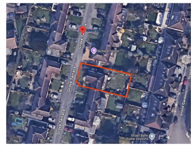
Aerial Plan nts

red41 Ltd ARCHITECTURE 41 Red Lane.....KT10 0ES 01372 460659.....07769651674