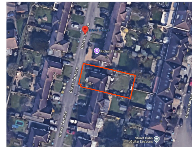
Aerial Plan nts

project: 10 GROVE TERRACE dra title: PROPOSED SITE PLAN dra no: 064-020-PR SITE @ roof lvl rev: B drawn by: SN scale: 1:100@A3 date: NOV '24 client: MR & MRS TURNER issue status: PLANNING