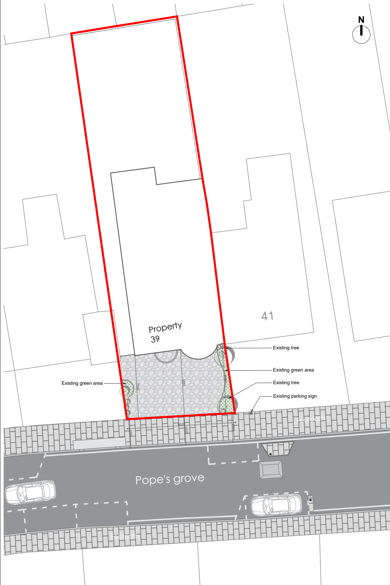
Existing Street Plan 1:200