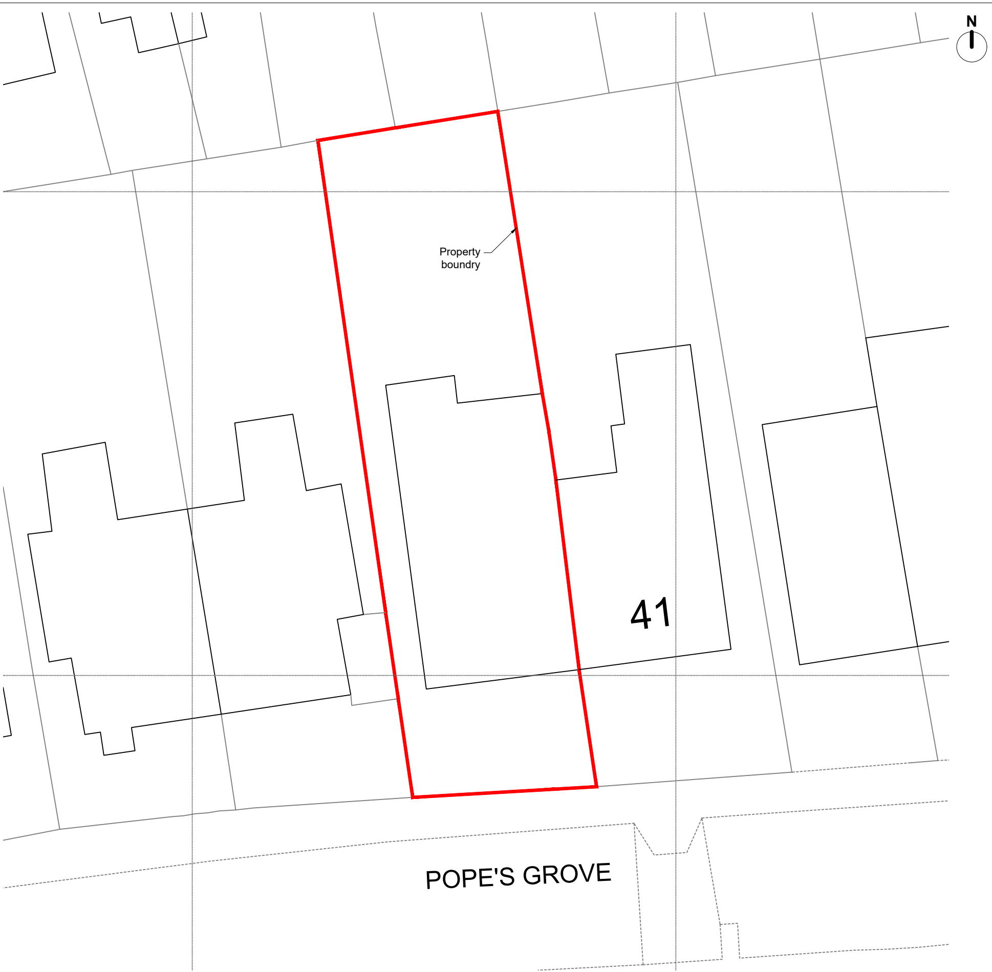
Site Map 1:200

© Crown copyright 2024 Ordnance Survey 100053143