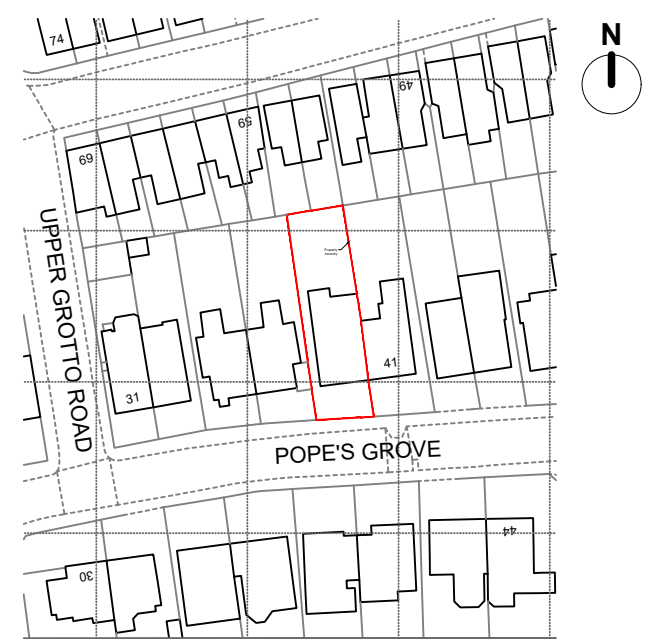
Block Map 1:1250