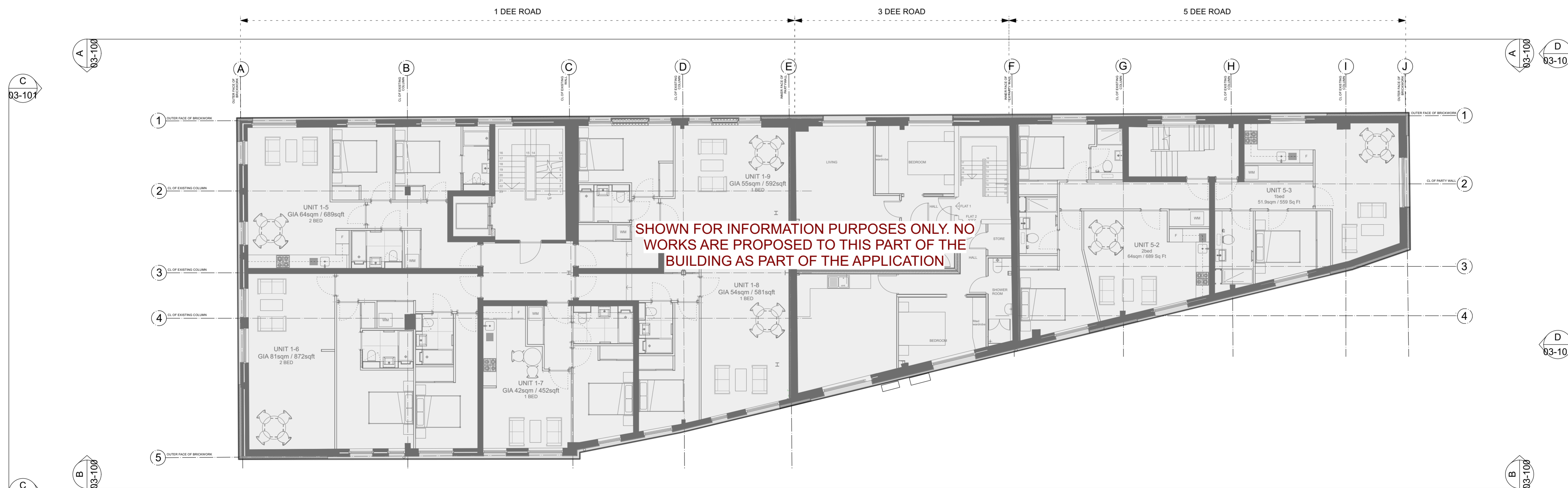
1 PROPOSED FIRST FLOOR PLAN SCALE 1:100 @ A1