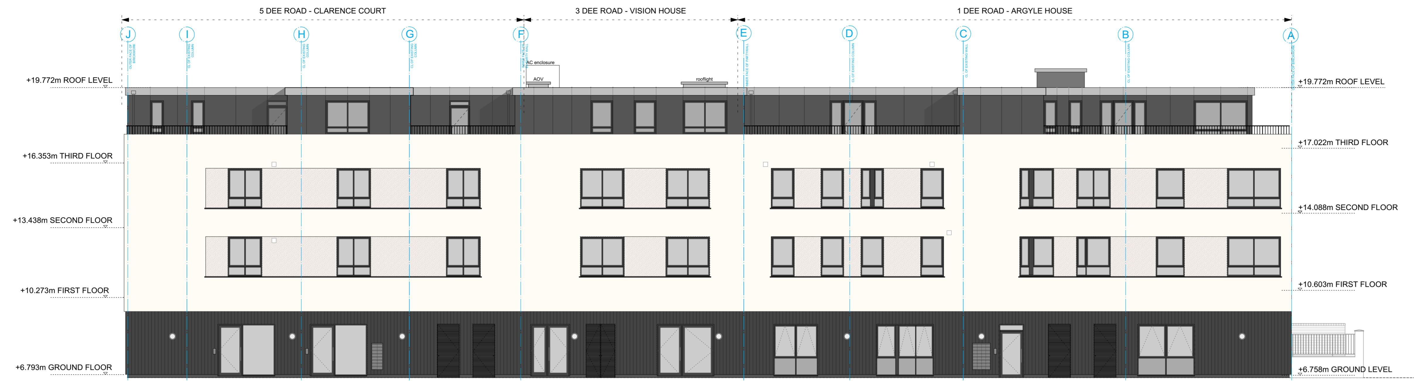
A EXISTING NORTH ELEVATION SCALE 1:100 @ A1