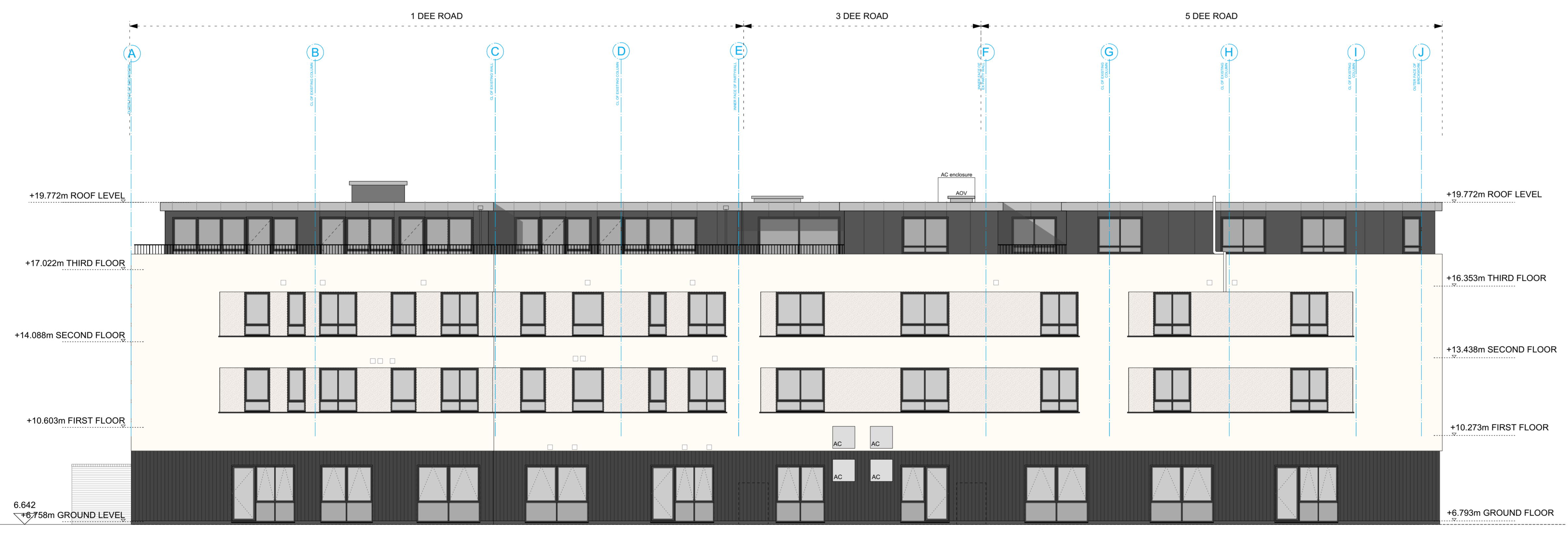
B EXISTING SOUTH ELEVATION - RAILWAY LINE SCALE 1:100 @ A1