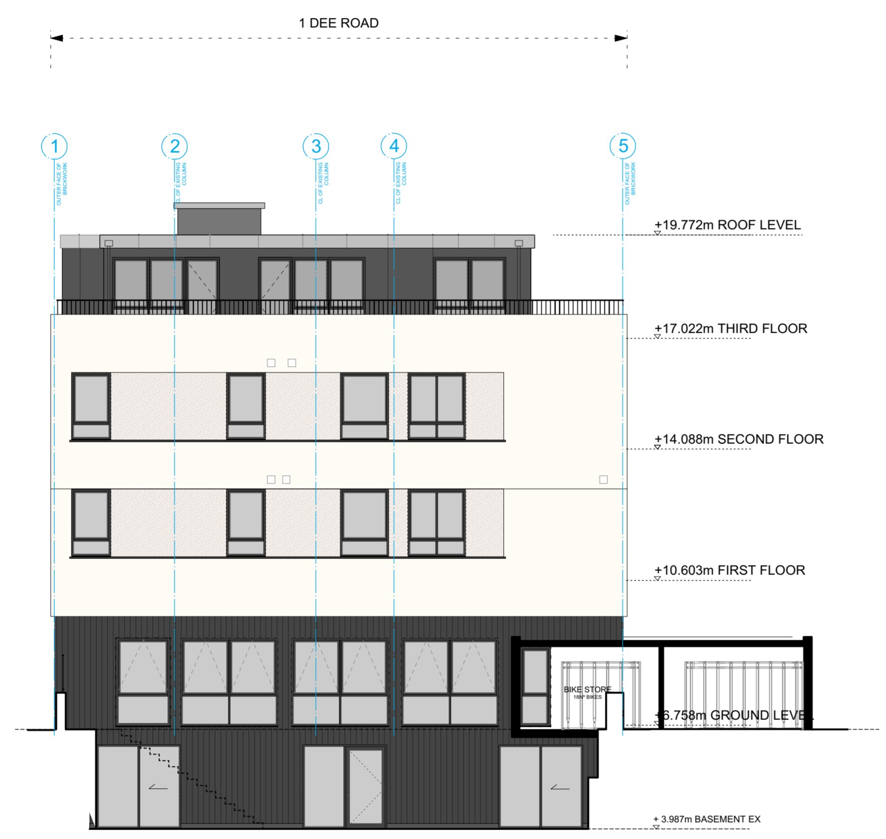
C EXISTING WEST ELEVATION SCALE 1:100 @ A1