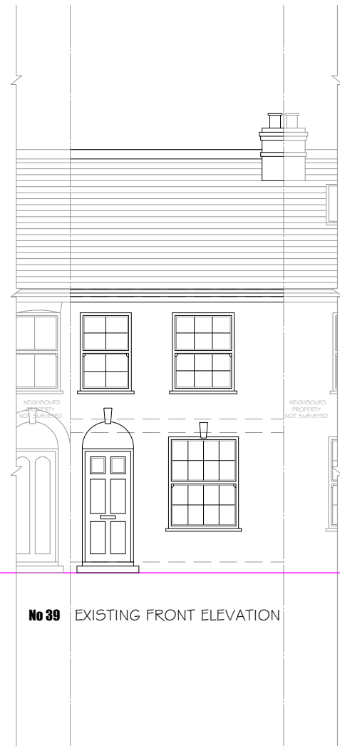
No 39 EXISTING FRONT ELEVATION

Notes All works to be carried out in accordance with current building Regulations. All dimensions / levels to be checked and verified on site before Commencing any work and any discrepancies to be reported to the office immediately. This drawing to be read in conjunction with contract documents, project working drawings, specification, all consultants / specialist drawings, details and specification. All materials to be used in the construction of the external surfaces of the new works shall match those in the existing building. Do not scale from this drawing except for planning drawings. Only figured dimensions to be taken. This drawing is copyright © 2023. Modifications to this drawing may only be carried out by GDB Must not be reproduced in part or in whole in any form without the prior permission of GDB This proposal must not be used for any other purpose other than stated above.