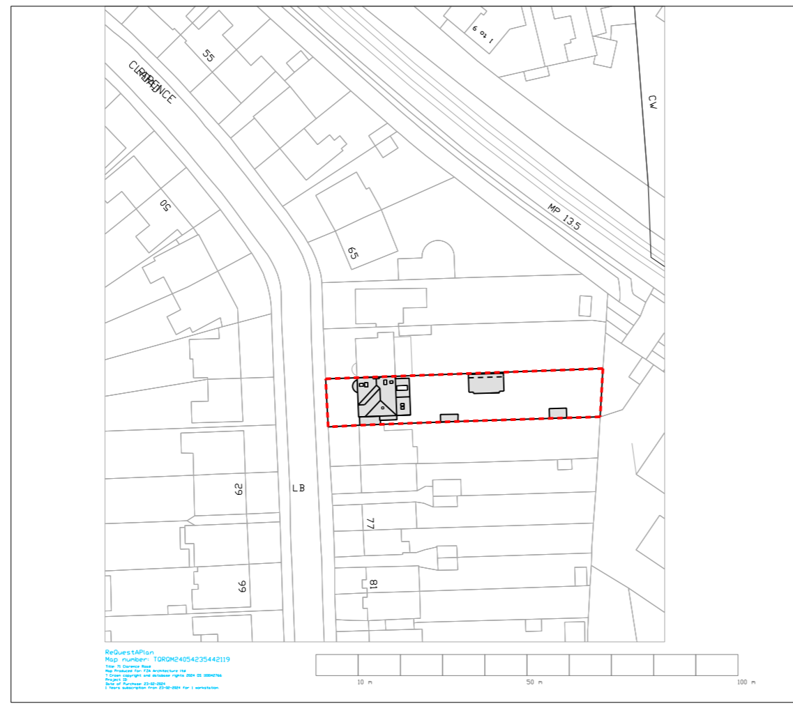
1 LOCATION PLAN EXISTING 1:1250