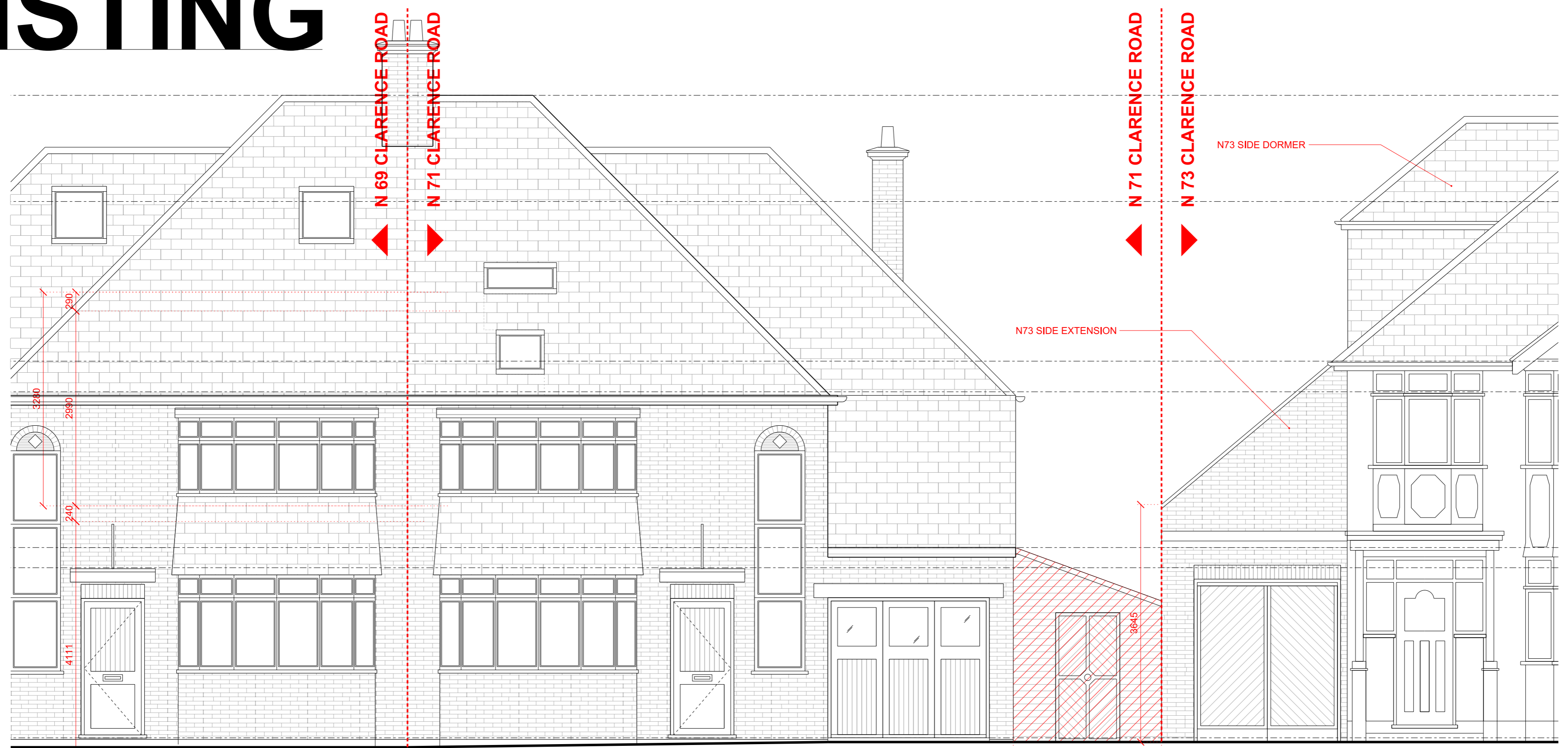
1 103 FRONT ELEVATION EXISTING 1:50

EXISTING LEAN-TO TO BE DEMOLISHED AND REPLACED