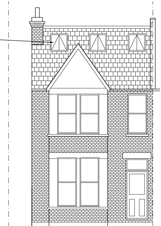
FRONT ELEVATION AS BUILT

Additional MK06 conservation grade velux window