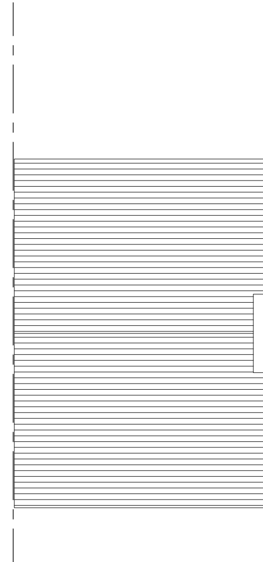
First Floor Plan Scale: 1:100