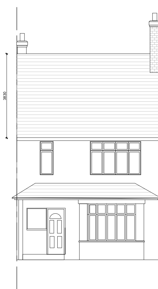
○ Front Elevation Scale: 1:100