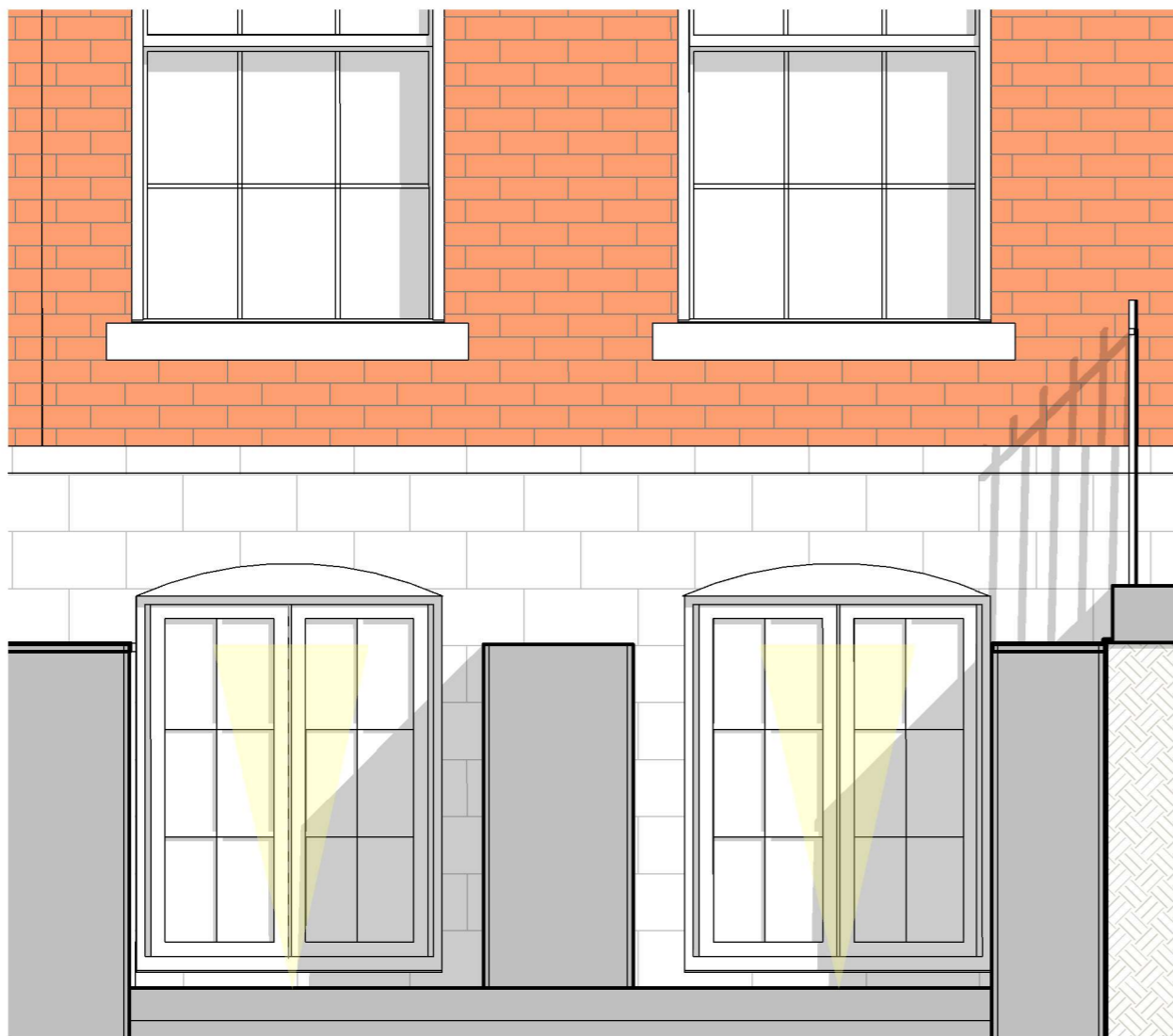
① Front Lightwell Elevation Scale 1 : 25