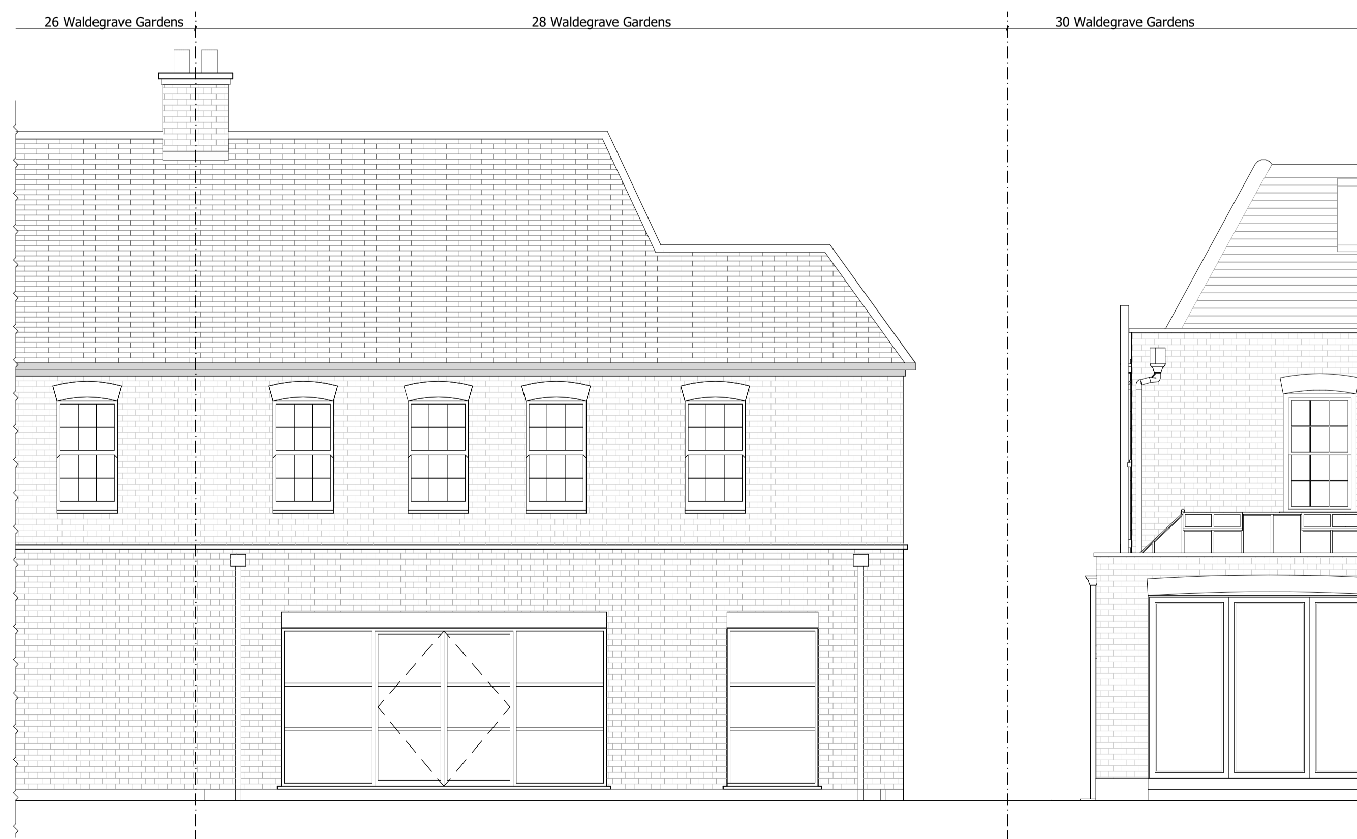
3 1:50 @ A1 EXISTING REAR ELEVATION