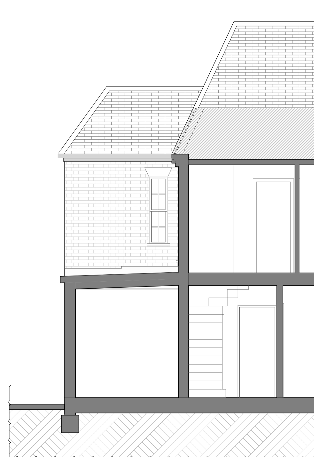
5 1:50 @ A1 EXISTING SECTION BB

DO NOT SCALE FROM THIS DRAWING (Construction Stage) Figured dimensions only are to be taken from this drawing. All dimensions are to be checked on site before any work is put in hand. If in doubt, ask. All 4H Architecture drawings to be read in conjunction with relevant 4H Architecture Finishes, Sanitaryware, Lighting & Ironmongery schedules. Any discrepancies to be highlighted to 4H Architecture prior to procurement and in good time. Copyright © 4H Architecture 2024 Registered in England & Wales. Registered No. 12112149