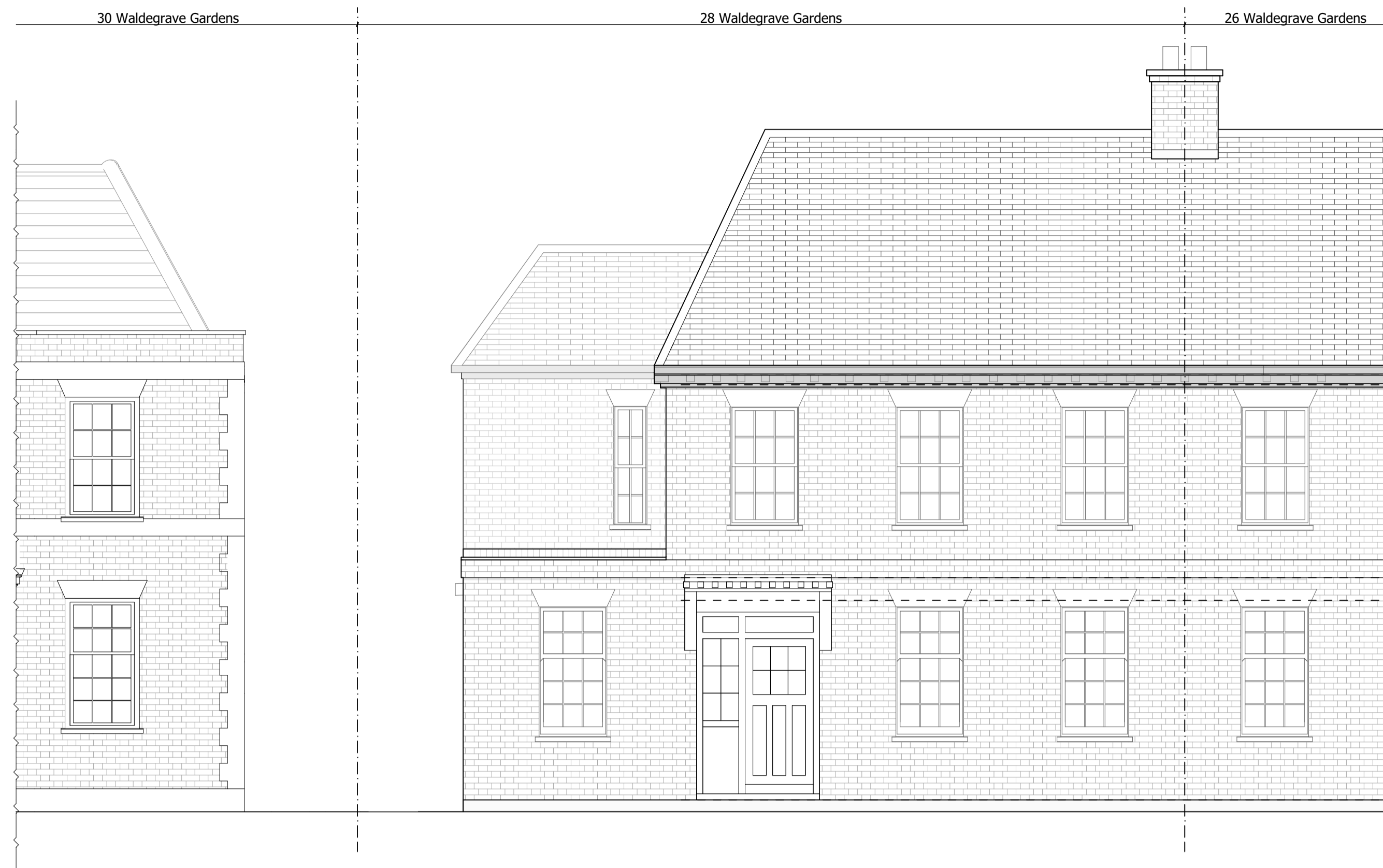
1 1:50 @ A1 EXISTING FRONT ELEVATION