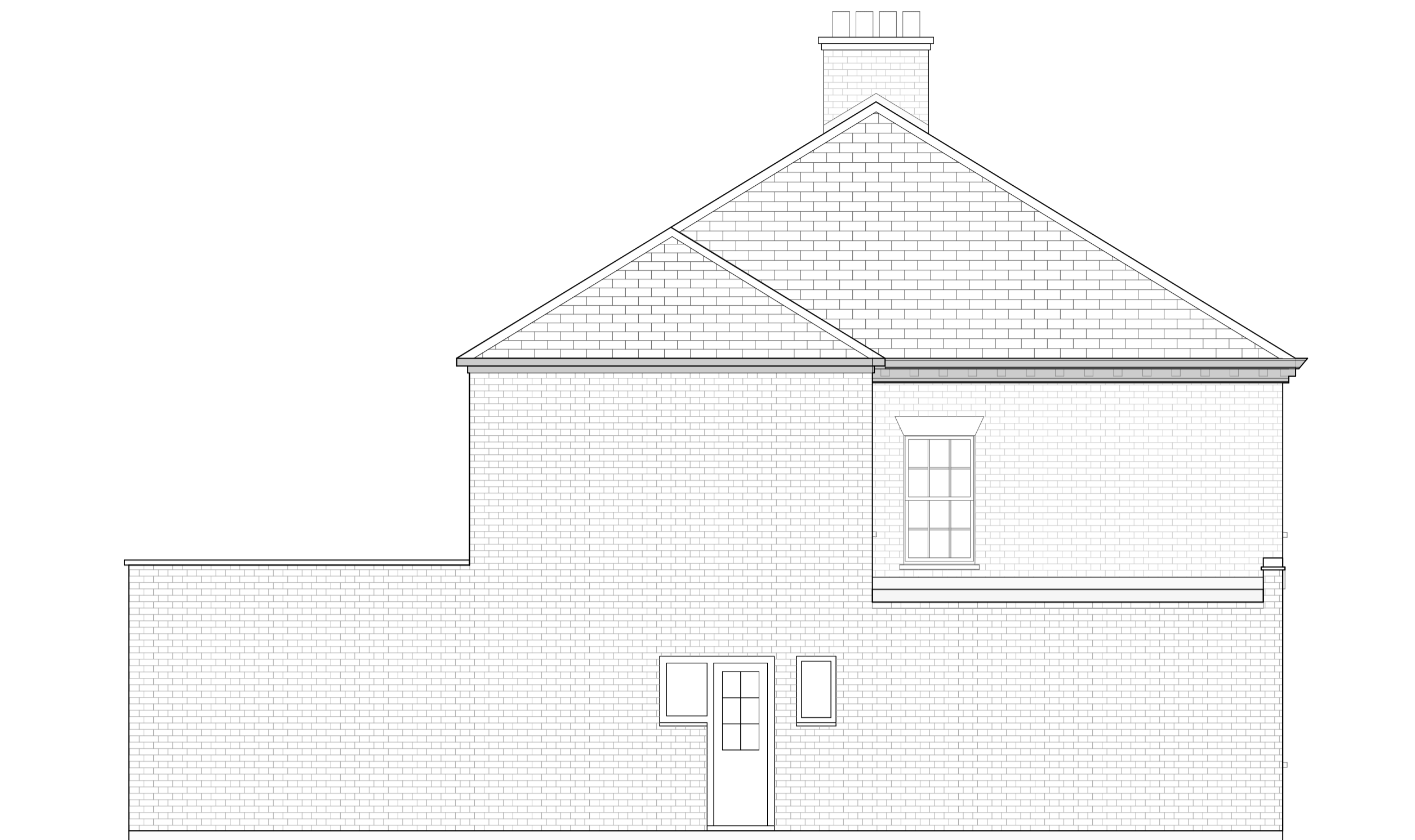
2 1:50 @ A1 EXISTING SIDE ELEVATION