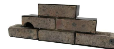
Integrated Swift Brick