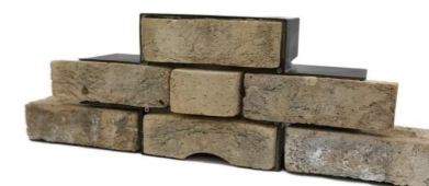
Integrated Bat Brick