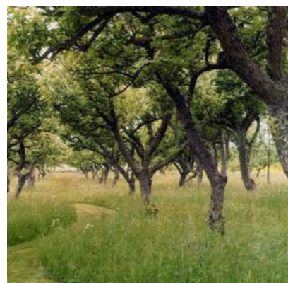
Native Trees & Wild Grass