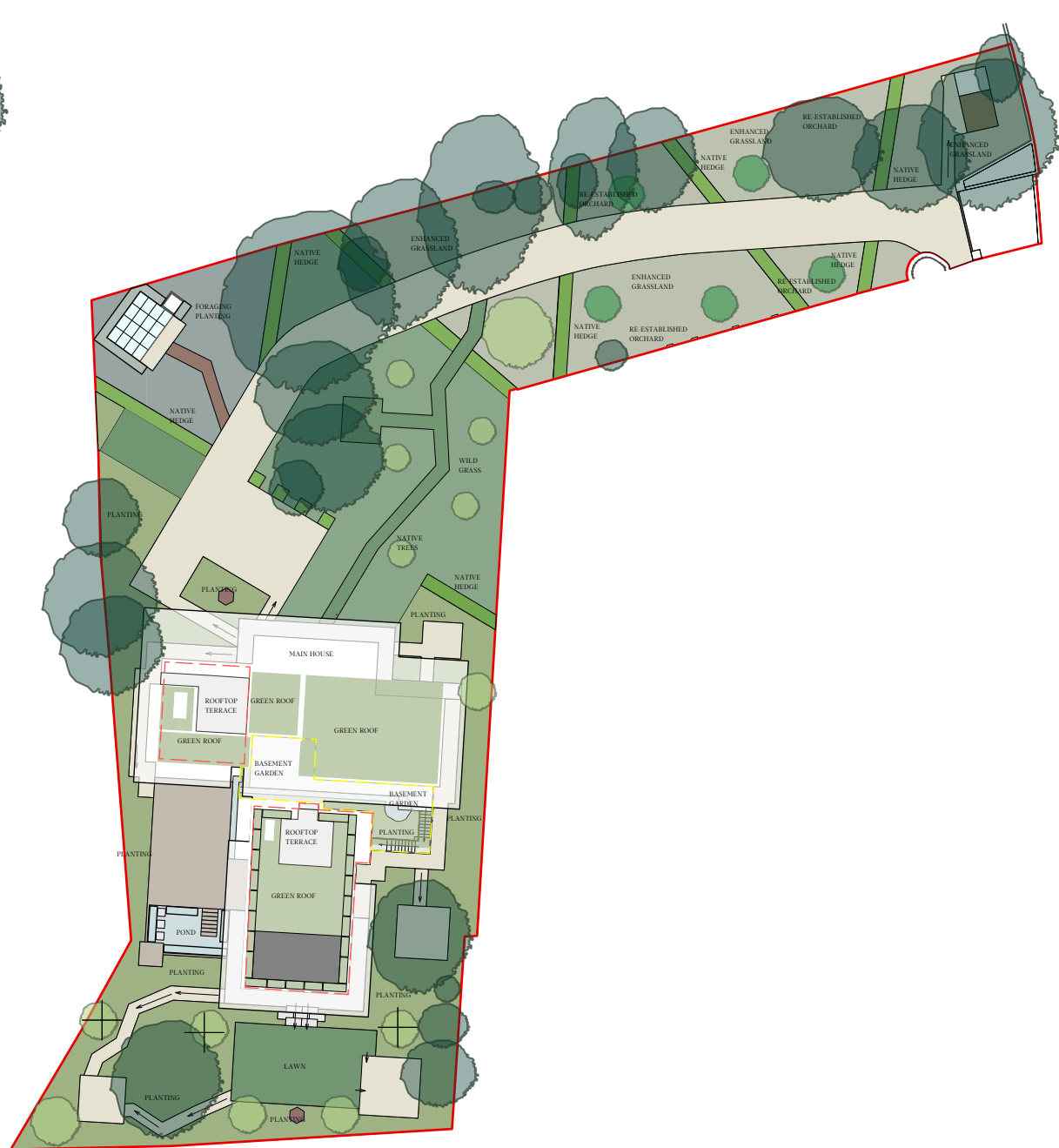
Proposed Habitat Scale: 1:500

Stage: PLANNING Drawing: Habitat Enhancement Plan