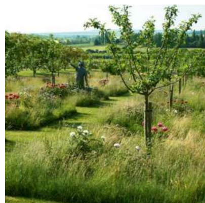
Orchard with Enhanced Grassland