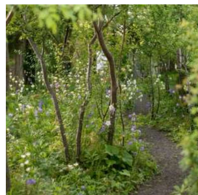
Native & Pollinator Friendly Planting