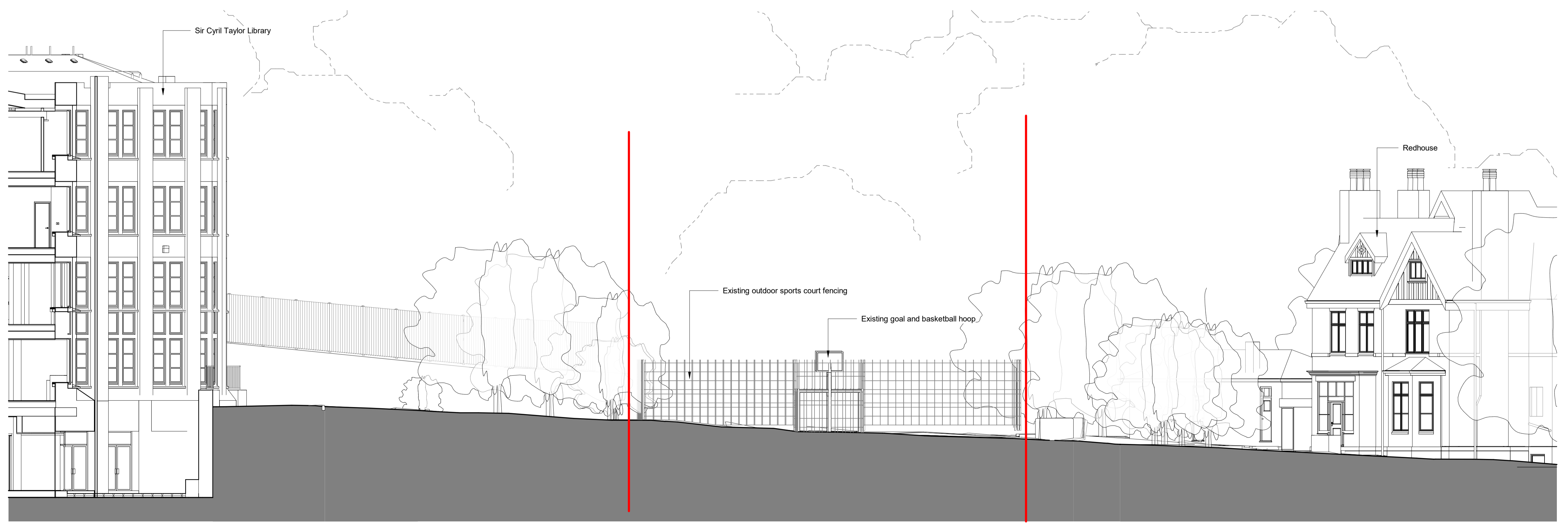
2 Existing Elevation 04 1:100