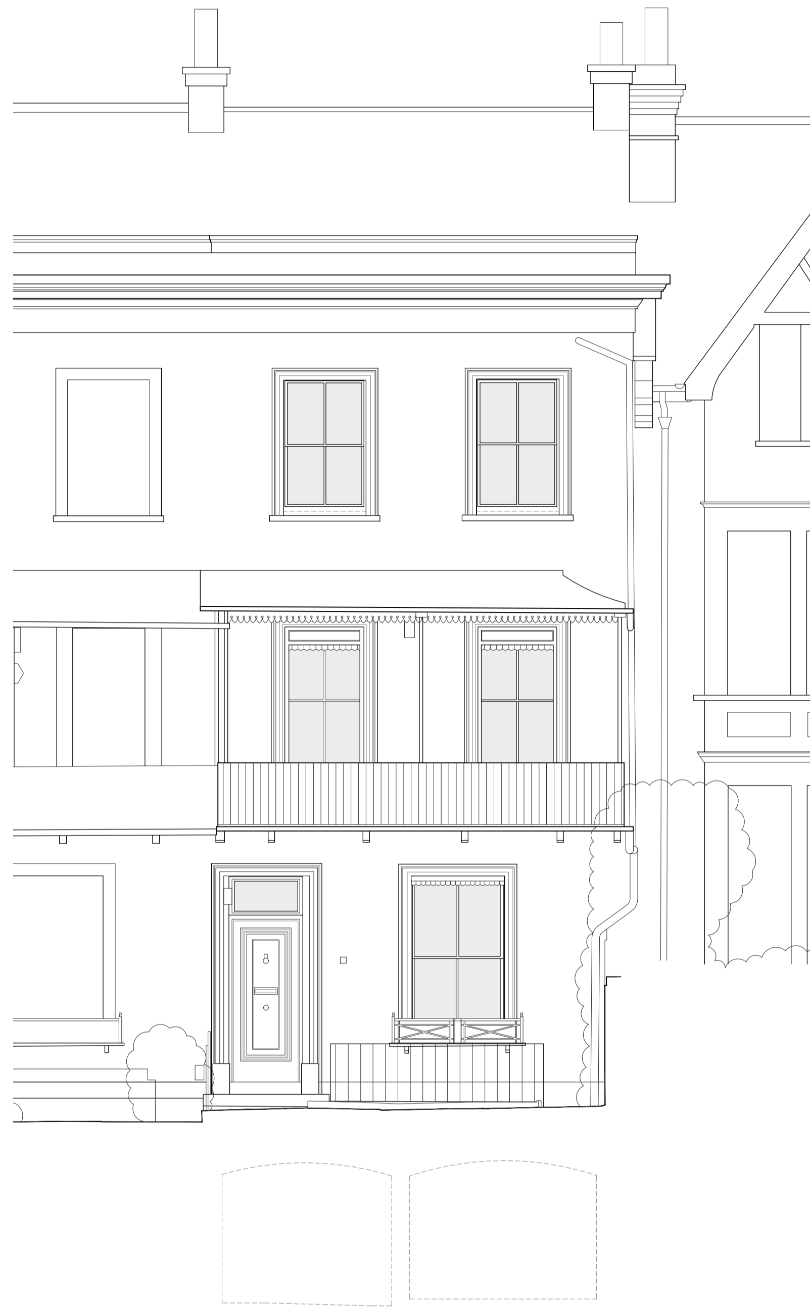
1 EXISTING FRONT DEMOLITION ELEVATION