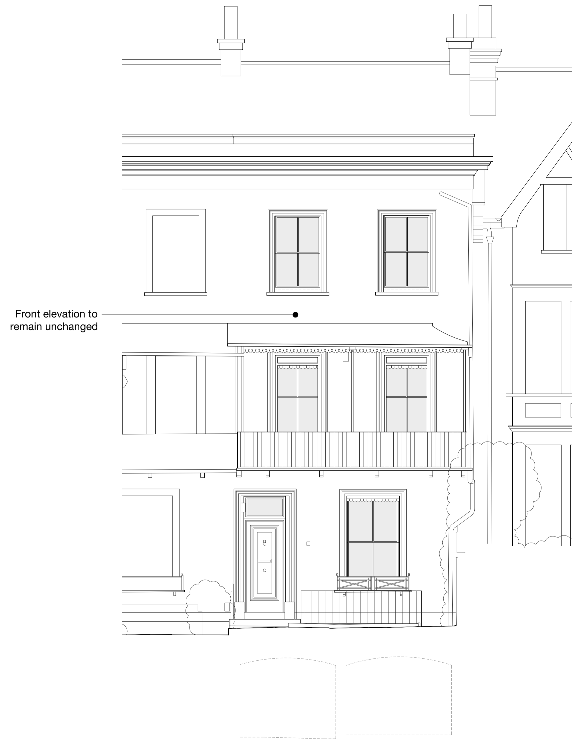
1 PROPOSED FRONT ELEVATION