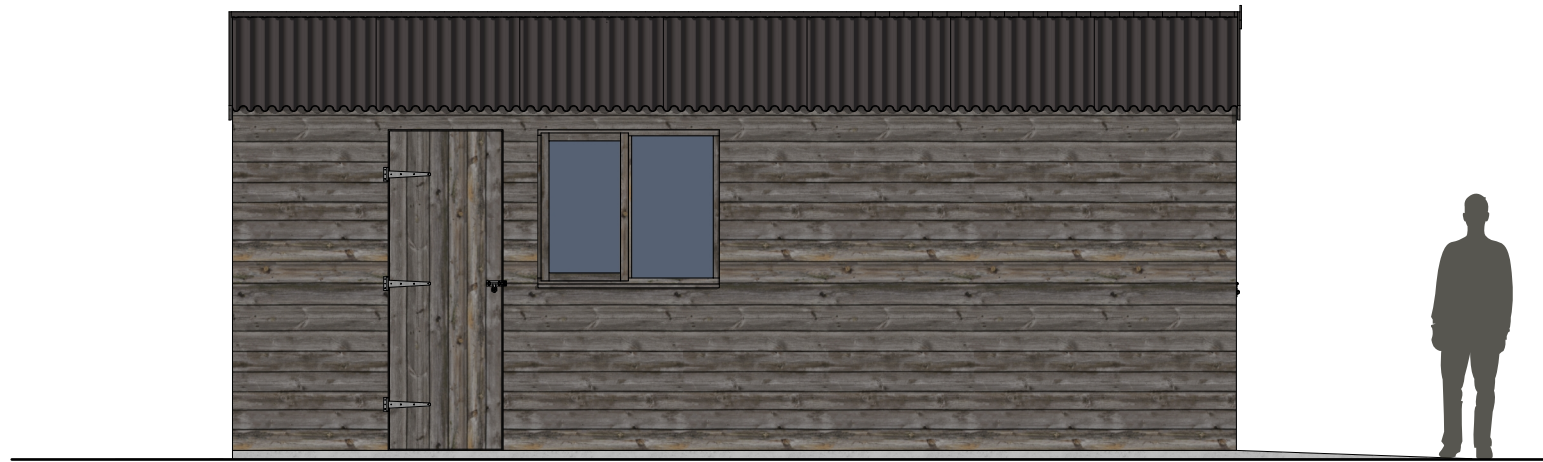
EXISTING - GARDEN ELEVATION / SOUTH