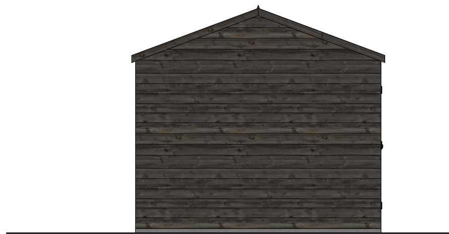
EXISTING - REAR ELEVATION / WEST