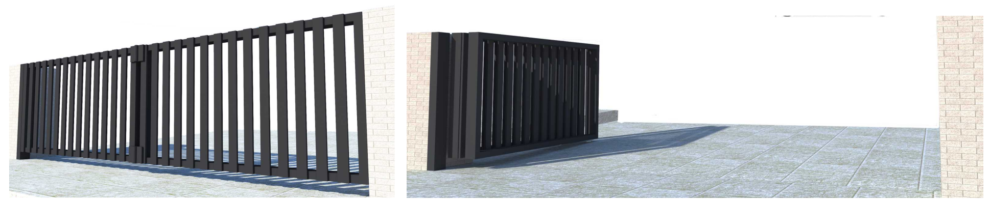
Indicative drawings of proposed automatic bifold driveway gate, viewed from street. Gate to be hinged towards the inner front of existing pillar.

Gate dimensions to be confirmed by specialist after site visit. Height not to exceed existing pillar height