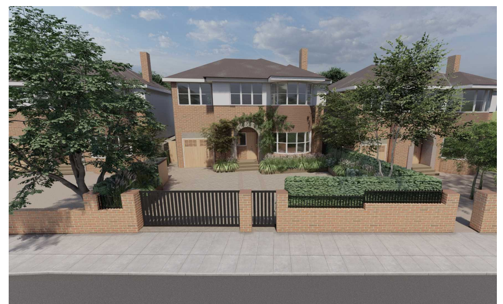
Proposed view from street