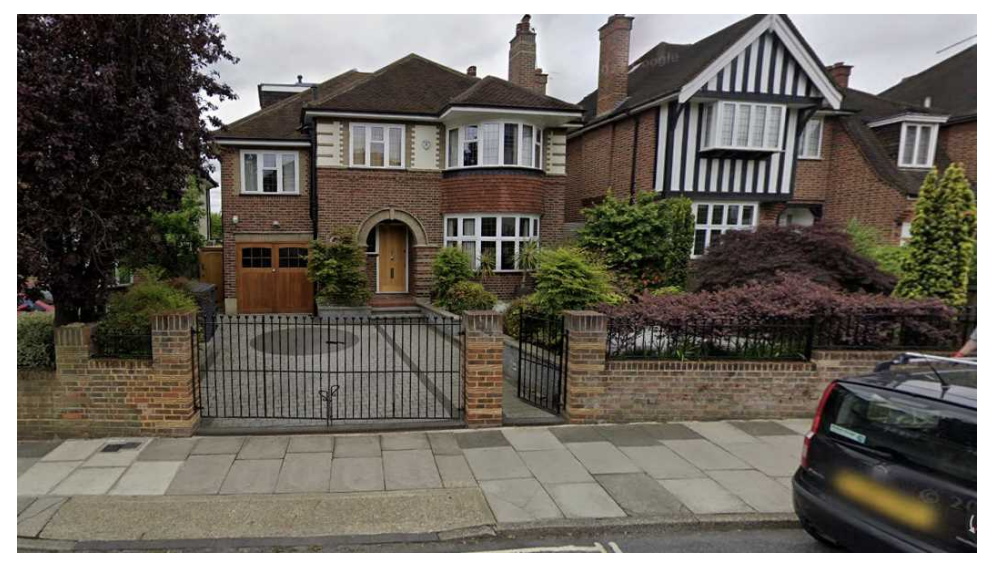
Current view from street