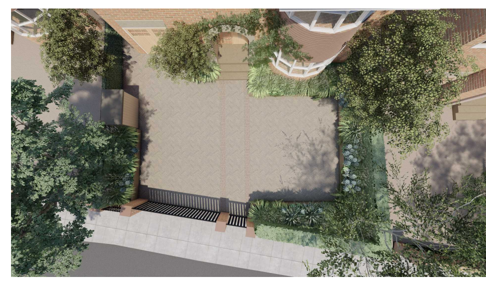
Proposed front garden layout