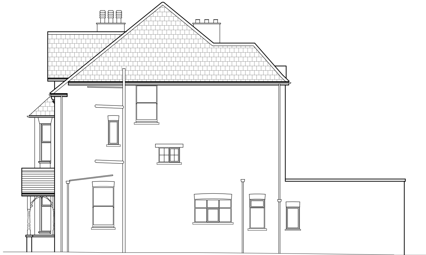
02 Existing Side Elevation 1:100 @ A3