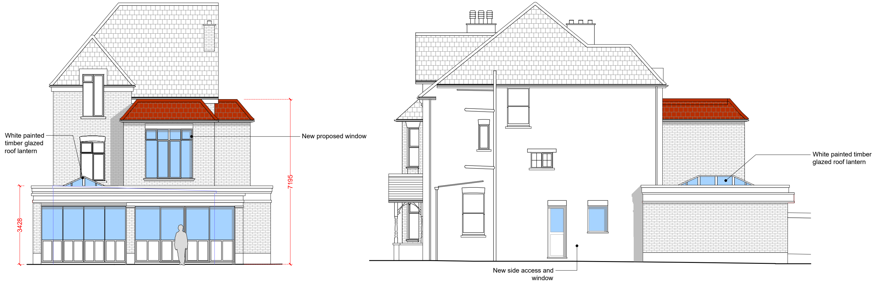
01 Proposed Rear Elevation 1:100 @ A3