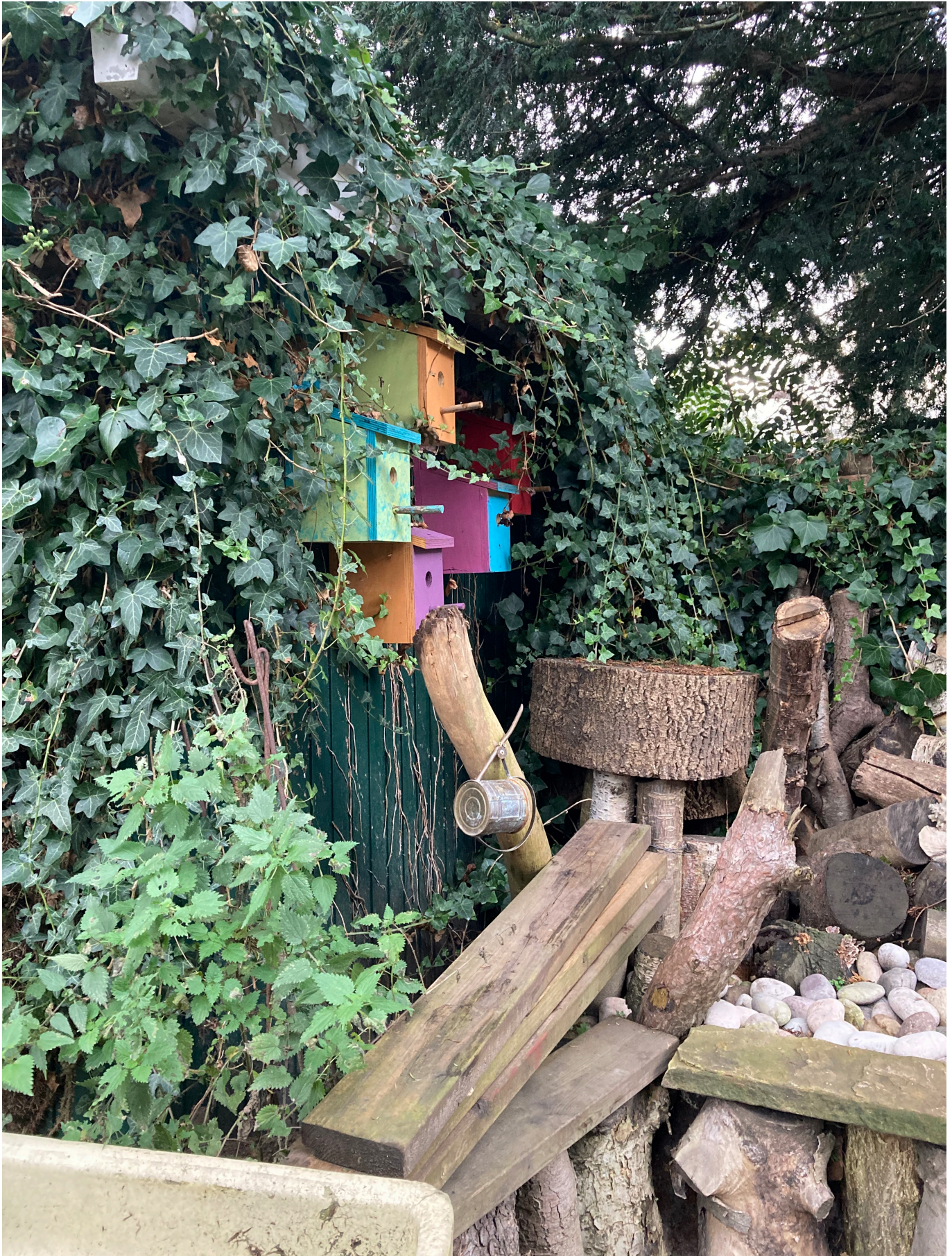
Fig 1: 5no. homemade bird boxes located on the store building