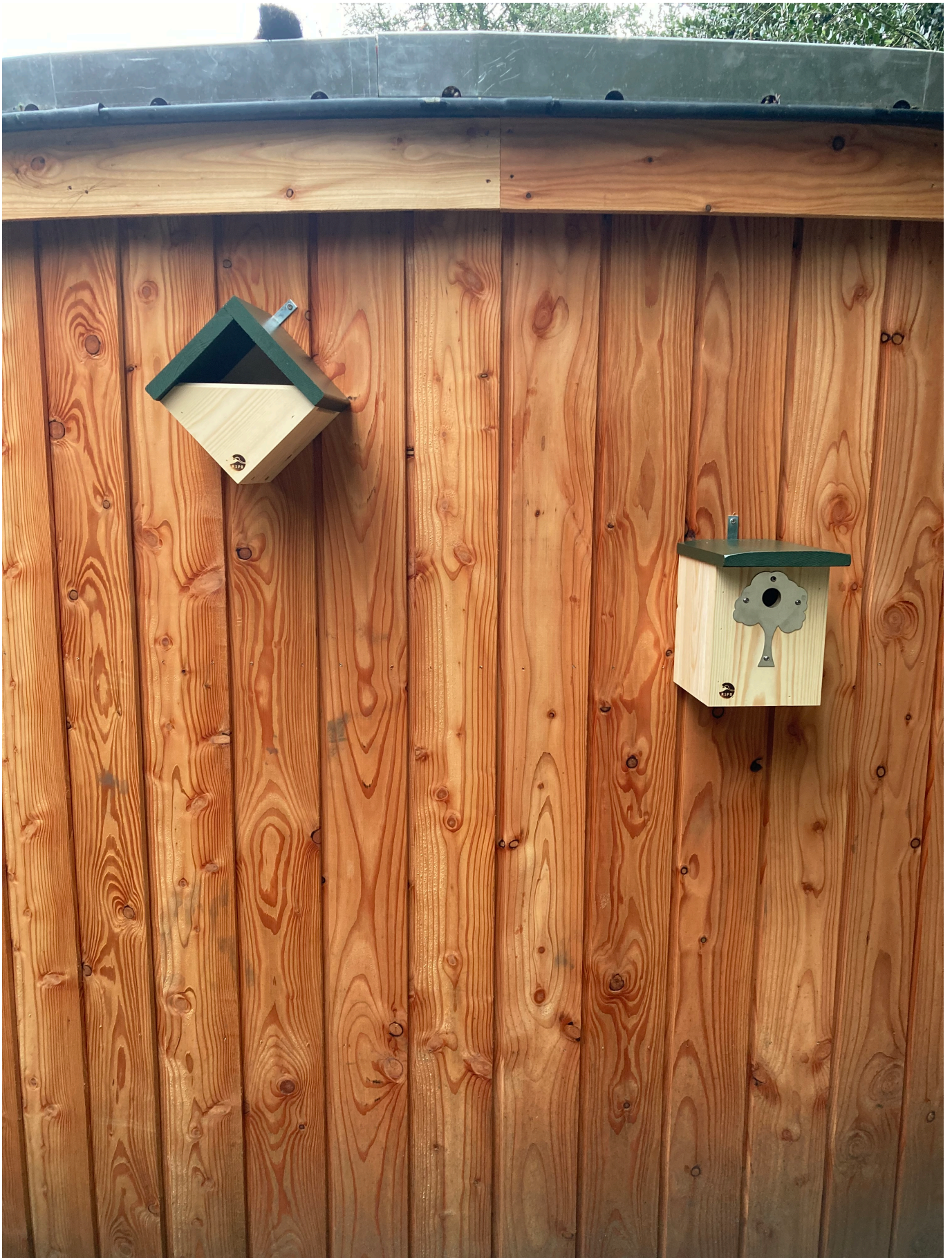
Fig 2: 2no. RSPB bird boxes located on the new roundhouse