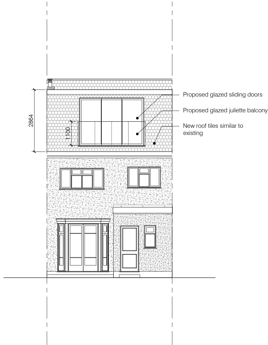
01 Proposed Rear Elevation