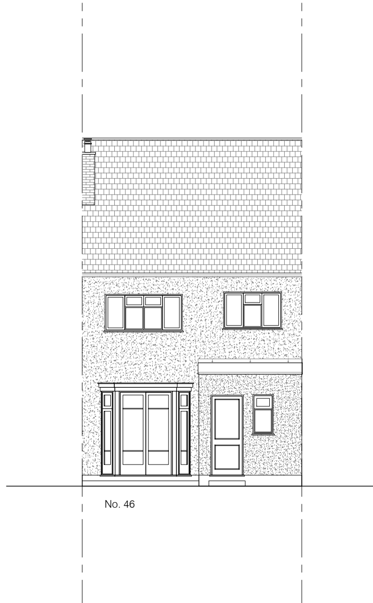
01 Existing Rear Elevation