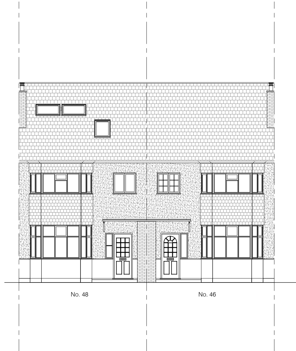
01 Existing Front Elevation