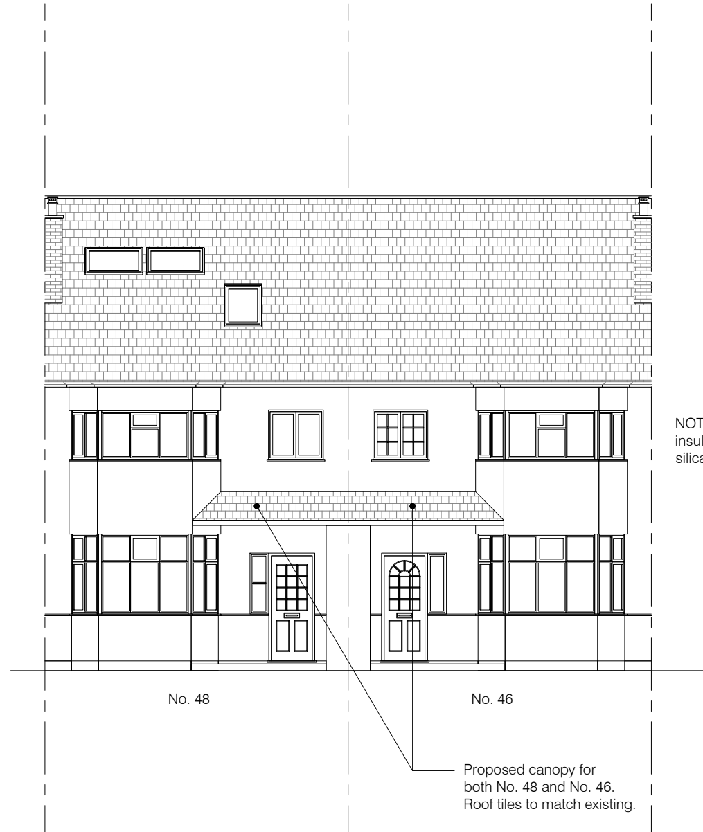
01 Proposed Front Elevation

NOTE: Existing walls of No.46 to be insulated externally and finished with silicate render.