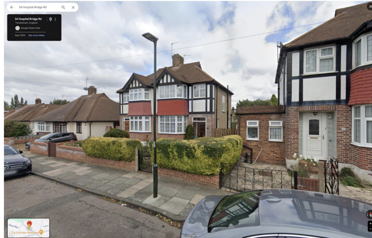
Street view of the existing house