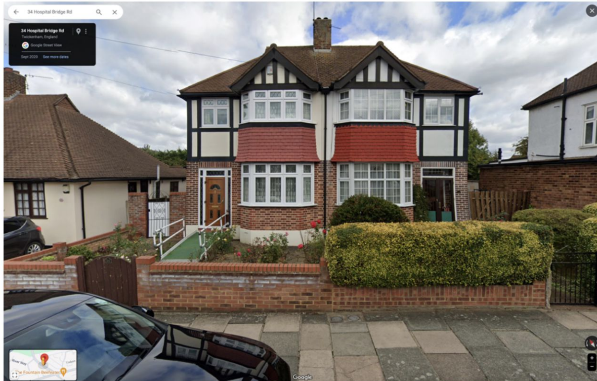
Street view of the existing house