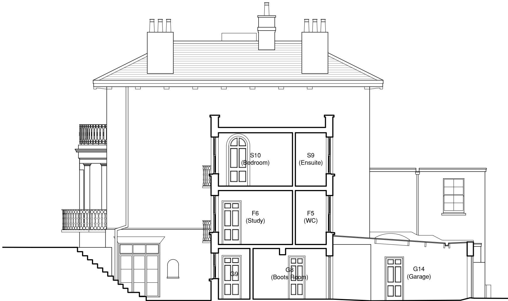
Existing South East Sectional Side Elevation A-A