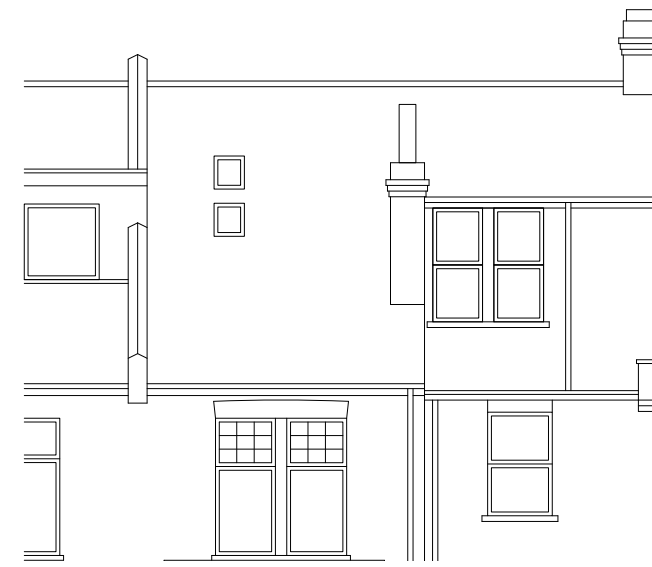
2 - Existing Rear Elevation Scale: 1:100