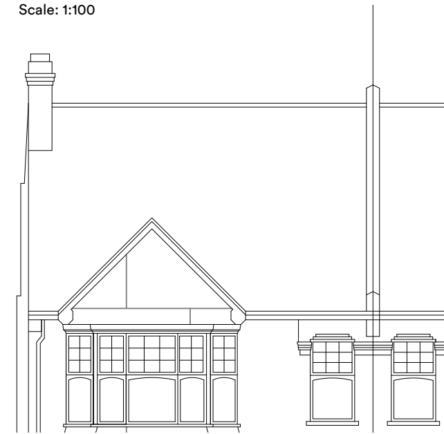
4 - Existing Front Elevation Scale: 1:100