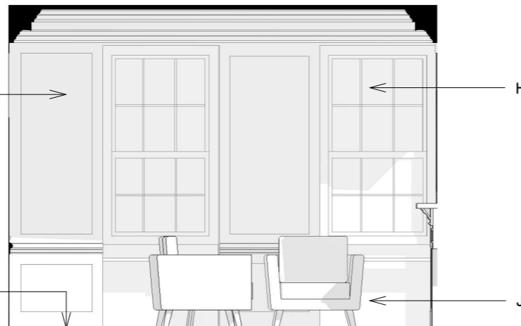
G.02 Elevation D