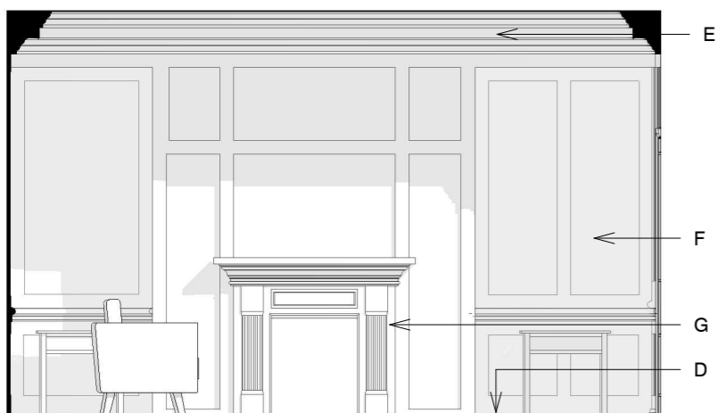
G.02 Elevation B