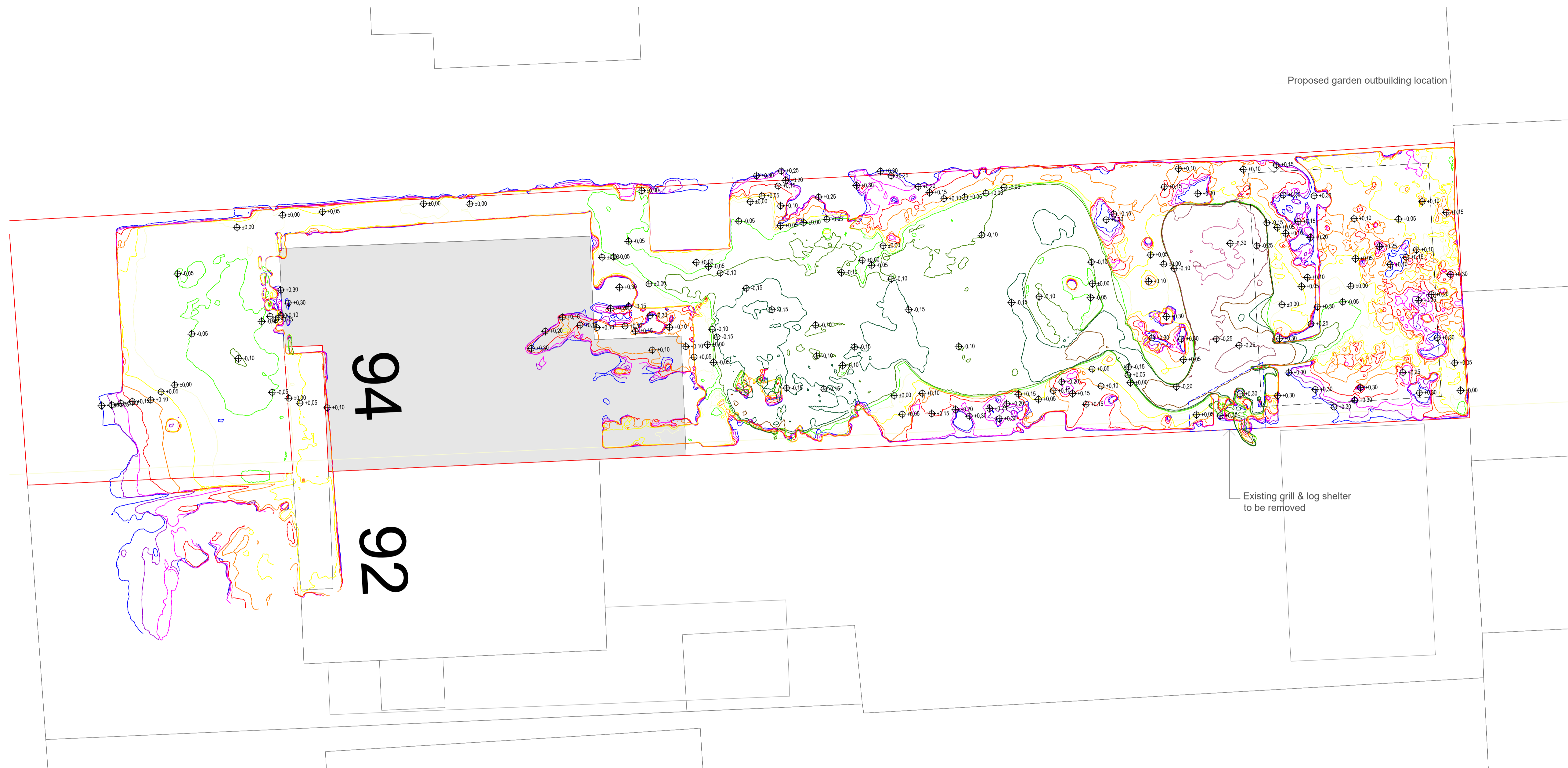
1 Existing Site Levels 1 : 750