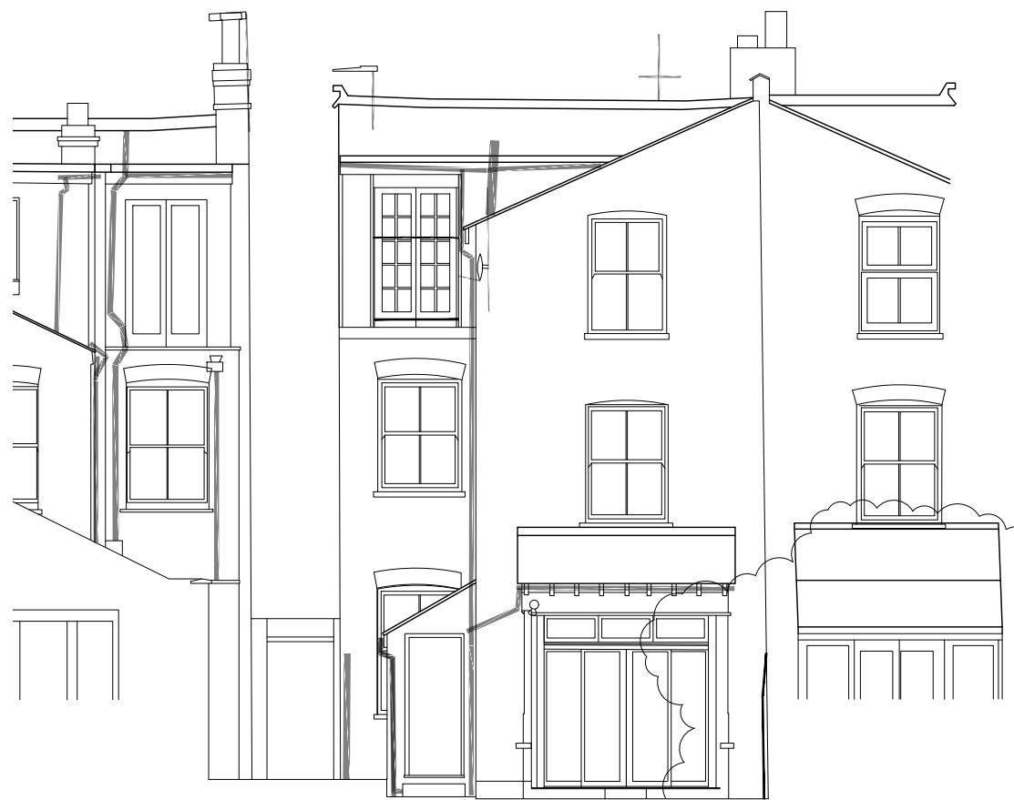
Existing Rear Elevation (2)