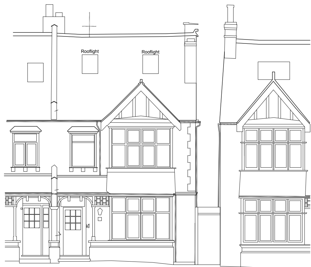
Existing Front Elevation (1)