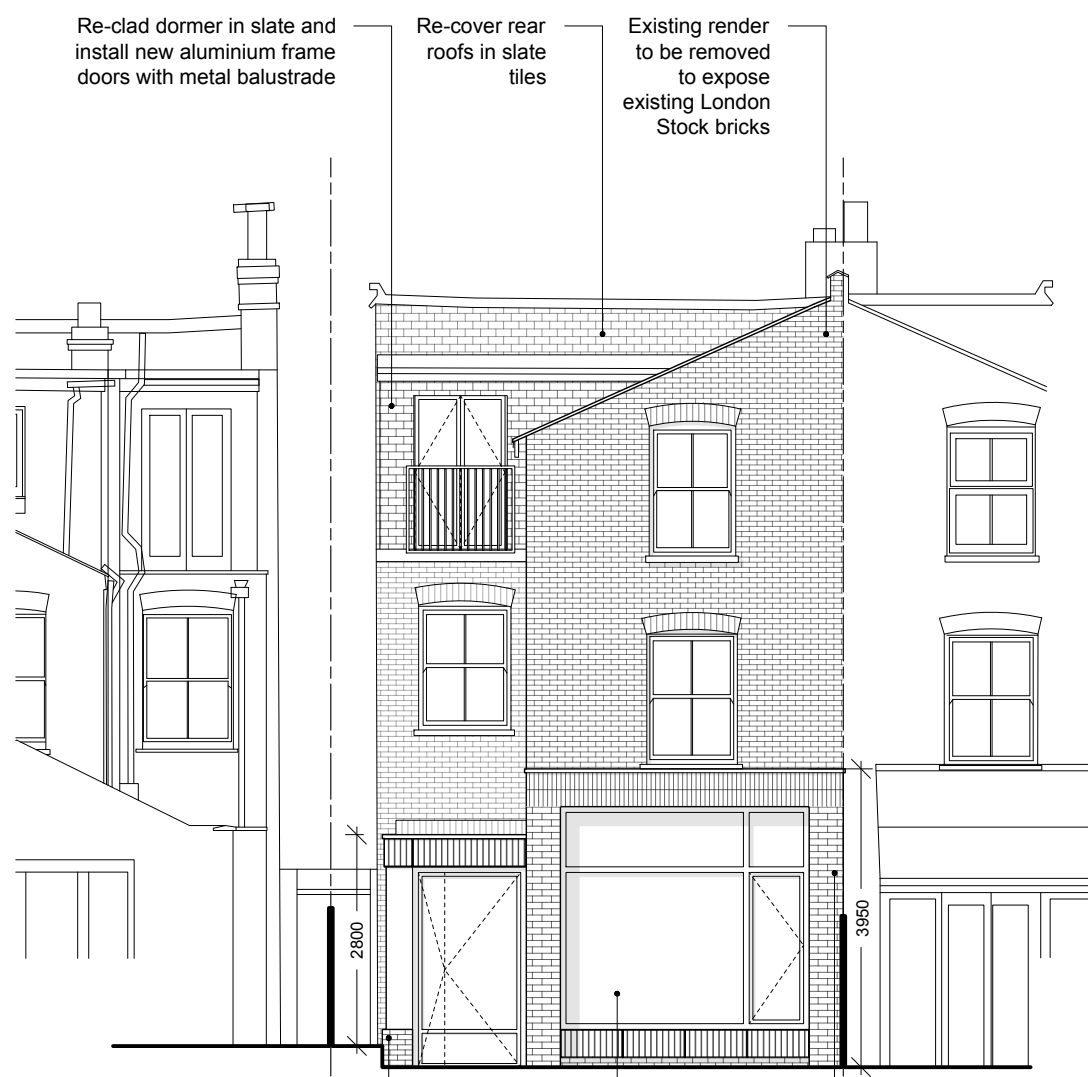
Proposed Rear Elevation (2)