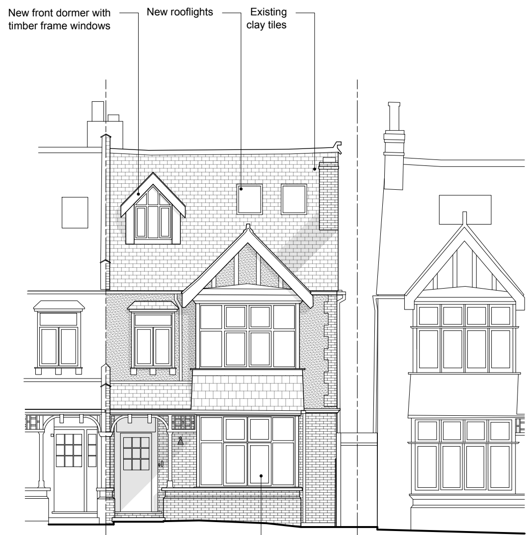
Proposed Front Elevation (1)