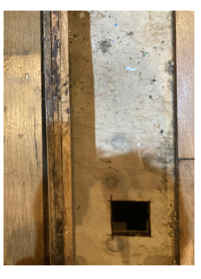
2 - Photo Close Up - Showing engineered flooring (no original flooring remains in the property). We assume existing joists are original and will be retained.