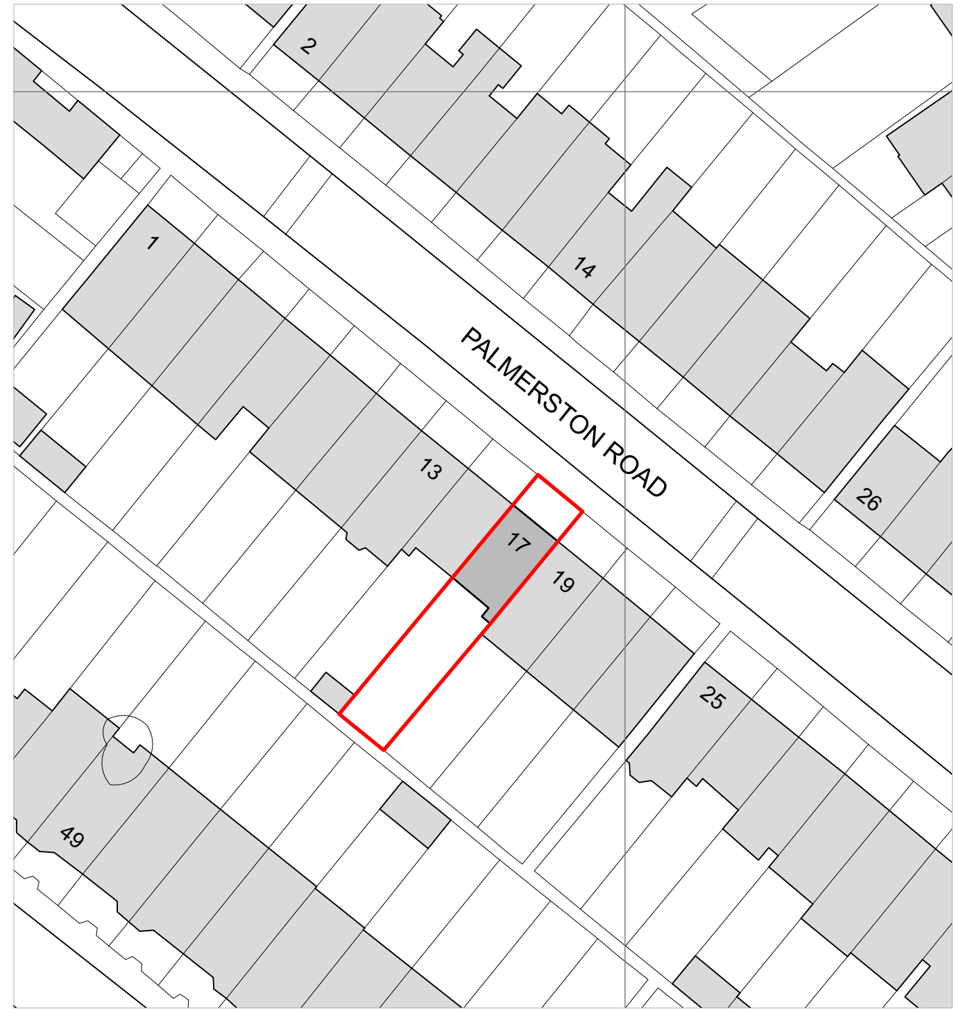
2 BLOCK PLAN - PROPOSED Scale 1:500@ A3